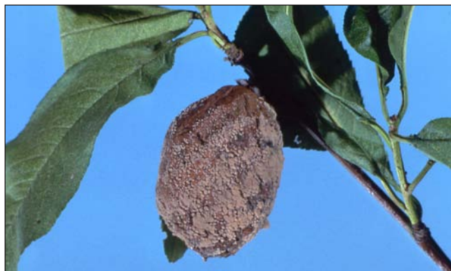
Figure 2. Brown rot producing spores on the surface of an infected peach fruit. These spores can infect other fruit.

Young fruits are normally resistant, but may become infected through wounds. As fruits mature they become more susceptible to attack, even in the absence of wounds. Fruit infections appear as soft brown spots which rapidly expand and produce a tan powdery mass of conidia. The entire fruit rots rapidly, then dries and shrinks into a wrinkled “mummy.” Rotted fruit and mummies may remain on the tree or fall to the ground. Fruit infection may spread rapidly, especially if environmental conditions are favorable and fruits are touching one another.