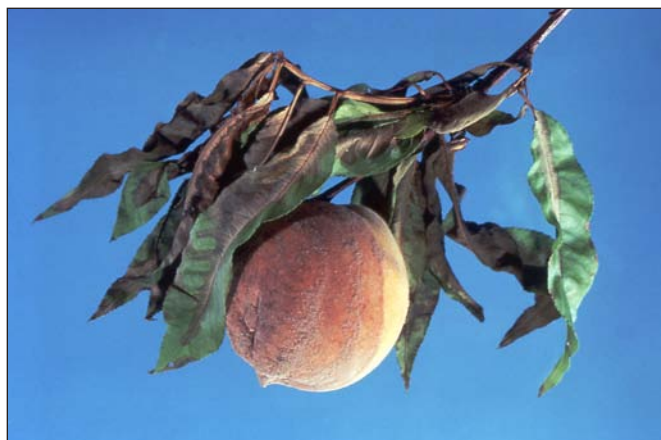
Figure 1. Brown rot on peach fruit. Note that the fungus has invaded the twig causing a twig blight as well.

The symptoms of brown rot are very similar on all stone fruit. Symptoms first appear in the spring as the blossoms open. Diseased flowers wilt, turn brown, and may become covered with masses of brownish-gray spores. The diseased flowers usually remain attached into the summer.