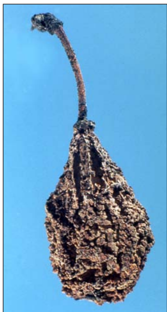
Figure 4. Brown rot mummy from an infected peach.