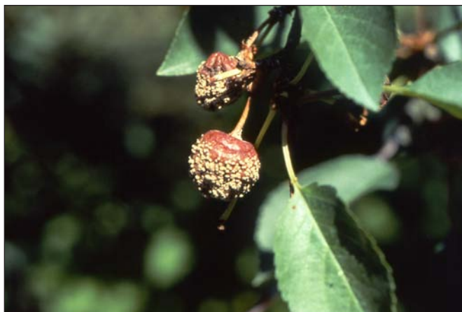
Figure 3. Brown rot on cherry fruit. Note the tufts of fungus on the surface of rotted fruit.