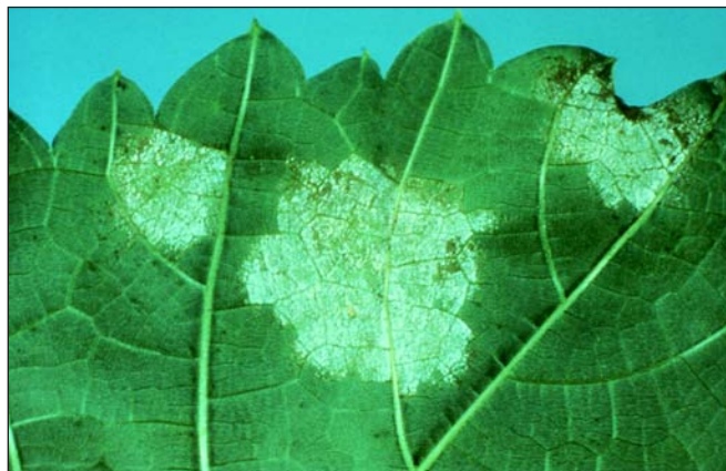
Figure 2. White “downy” fungus growth on the underside of infected leaves. This downy growth is directly under the pale-yellow spots on the upper surface.