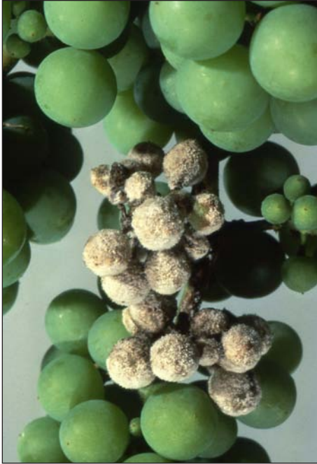
Figure 3. Grape berries infected with downy mildew. Note the cottony growth on the surface of the berries.

shoots and tendrils, early symptoms appear as water-soaked, shiny depressions on which the dense downy mildew growth appears. Young shoots usually are stunted and become thickened and distorted. Severely infected shoots and tendrils usually die.