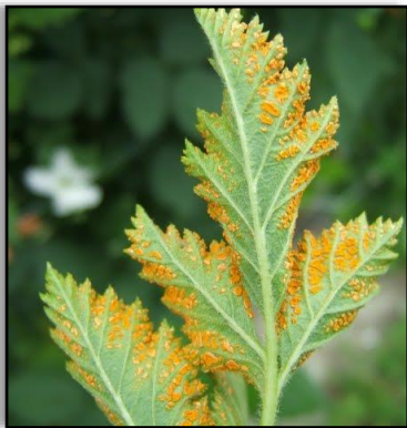
Orange rust on blackberry

Early detection of diseases is an essential component of an IPM program. Some of the early diseases you should be on the look-out for are listed here.