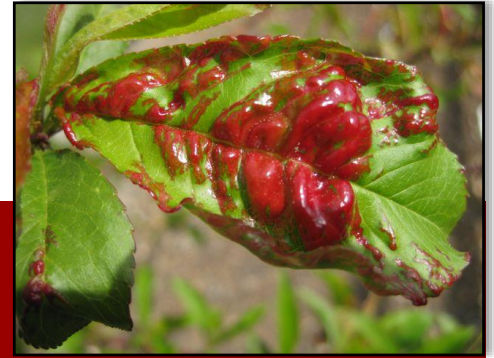
Peach Leaf Curl

For details on how and where to submit a sample please visit the diagnostic laboratory website or contact Rachel Medina to have instruction mailed to you.