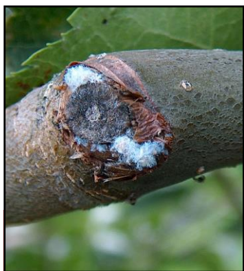
Woolly Apple Aphid on apple tree bark