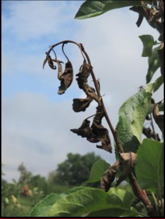
Fire blight on apple