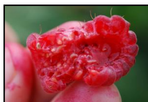
Raspberry fruit damaged by larvae of Spotted Wing Drosophila

The 2016-2017 update of insecticide products for fruit and vegetable crops can be found using this link .