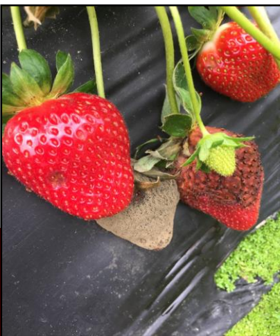
Ohio Strawberry Plasticulture

Annual strawberry production using plasticulture is increasing in Ohio. In the past year, Ohio growers have reported a steady decline in fall plant growth due to plant dieback, collapse, and/or wilting, especially during the second crop cycle (i.e. year two of an annual crop cycle). Symptoms and disease patterns were indicative of Colletotrichum crown rot and of the few samples received by my program, Colletotrichum spp. was identified in each case. However, a thorough survey of diseases in strawberry plasticulture production in Ohio has not been conducted. With support from the Ohio Vegetable & Small Fruit Research & Development Program , a statewide survey will be conducted to identify the soilborne diseases affecting strawberry produced using the annual plasticulture production system.