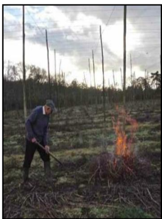
Burning of Hops plants post season harvest to reduce pathogen presence in the hopyard