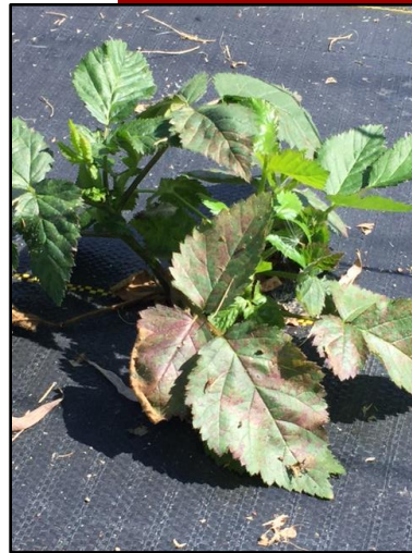
Stunted plant with downy mildew