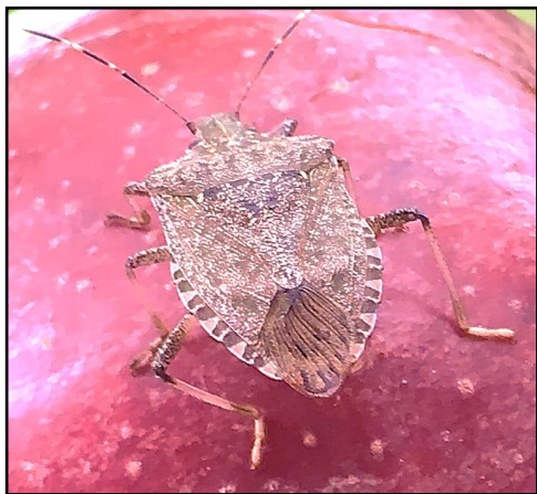
Adult Stink Bug

We are still finding stink bugs active in late-maturing apples and berries as well as in soybeans, sweet corn, peppers, and tomatoes, and around buildings. Most are the brown marmorated stink bug, but we are also finding some of our native green stink bug, brown stink bug, and the dusky stink bug. Most are adults, as shown in the picture above, but some nymphs are being found. It is the new adults that are quite mobile that are starting to seek protected places to overwinter, such as in buildings or tree stumps or firewood piles.