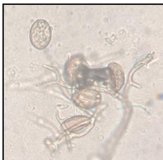
Spores of the downy mildew pathogen

So, is downy mildew of blackberry an emerging disease in Ohio? The honest answer is we don't know. To date, we have only observed it on Ouachita plants in two adjacent production fields in Wayne County. Every plant in the field had downy mildew symptoms and disease severity was 15-20%, with most of the symptoms occurring on the lower leaves. In the United States, blackberry downy mildew has only been reported in Arkansas, California and the Pacific Northwest. The extent to which the disease is present in Ohio is unknown as is the range of varieties to which the pathogen can infect. Another complicating factor is that the pathogen can also be present in plants without showing symptoms (asymptomatic). With so many unknowns it is difficult to make management recommendations specific to Ohio production practices. However, we do know a lot about downy mildew diseases of other crops and there has been a lot of excellent research done on blackberry downy mildew management in Mexico. Based on this information it is clear that a management program that integrates routine scouting for symptoms, early diagnosis, resistance, cultural and sanitation practices, proper nutrition and the application of chemical or biological products is necessary for controlling this disease. In addition, when purchasing new plants always ask the seller about their disease screening and testing procedures.