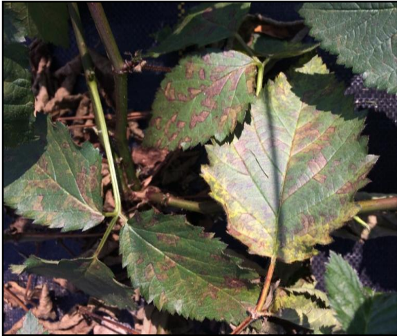
Foliar symptoms of downy mildew on blackberry