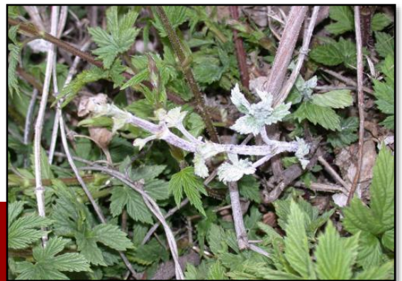
Powdery Mildew on Flag Shoots