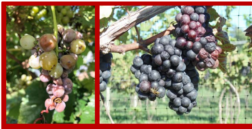
Figure 1. Left: Sour rot symptoms on white 'Traminette' grape berries. Right: Brick-colored berries are symptomatic of sour rot disorder on red berries such as 'Pinot Noir' grapes. Right photo B courtesy of Y. Woodworth, OSU- OSU-Ashtabula Agricultural Research Station.

Sour rot requires the presence of wounded fruit and the interaction of fruit flies, yeast, and bacteria for symptoms to develop. For example, when berries are injured by birds, hail, insects, or pruning, the subsequent open wounds attract fruit flies that transmit sour rot-associated microbes to the fruit. Two species of fruit flies are associated with sour rot development – the common fruit fly, Drosophila melanogaster , and the spotted-wing drosophila, D. suzukii . Common fruit flies can access fruits only after a wound has been inflicted but spotted-wing drosophila has a specialized egg-laying organ that can cut the berry skin and create a wound (Sepesy, 2019) that contributes to sour rot development. These flies introduce specialized bacteria ( Acetobacter spp. and Gluconobacter spp. ) into the wounds that interact with wild yeasts ( Saccharomyces spp. ) to produce acetic acid. Acetic acid is responsible for the distinctive vinegar-like odor associated with sour rot. The production of acetic acid further attracts fruit flies and other insects, contributing to the spread of sour rot within and between clusters.