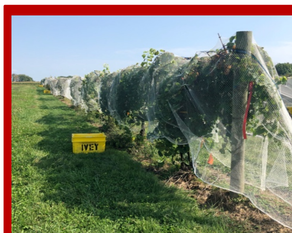
Figure 3. Netting grape vines from véraison through to harvest will deter birds from damaging grapes and reduce the risk of sour rot.