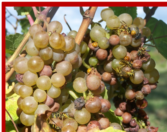
Figure 4. Yellowjackets feeding on grape berries with sour rot.

Commercial or homemade wasp traps (Shetlar, 2012) can be placed in the vineyard to reduce the number of foragers in the vicinity; however, these traps will not eliminate wasp colonies and are most useful if used throughout the season.