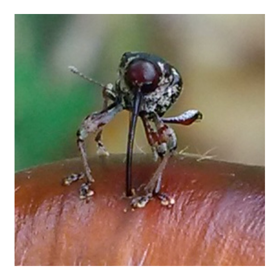
Figure 1. An adult chestnut weevil drills a hole in a chestnut before laying eggs.

chestnut where people would collect nuts from the forest and sell them without any tree care and maintenance.