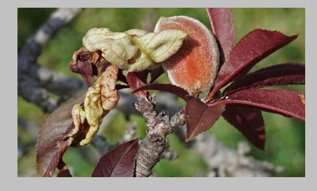
Peach leaf curl.

Although peach leaf curl is considered a springtime disease, the best time to control the disease is in late autumn when the leaves fall. However, control can be achieved any time before bud swell. The fungus that causes peach leaf curl, Taphrina deformans , survives the winter on the surface of twigs and buds. In the early spring, the fungus infects new leaves as they emerge from the buds. As the leaves mature, they become resistant to new infections. Leaf curl is actually very easy to control and requires only a single yearly application of fungicide. If you apply the fungicide before bud swell and you get good coverage peach leaf curl will not be a problem in your orchard or home garden!