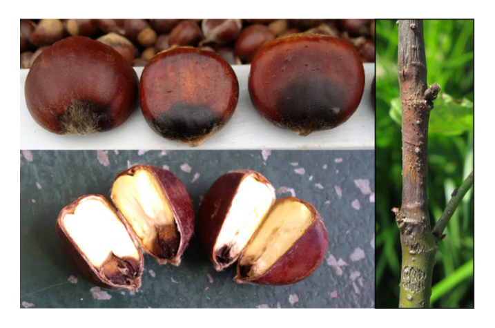
Figure 3. Chestnut anthracnose in nut and twig.

Chestnut Anthracnose (aka Blossom End Rot): Chestnut anthracnose is a disease caused by the fungus Colletotrichum. The fungus causes cankers on chestnut twigs and black lesions on chestnut kernels (Figure 3). The lesions on the kernels are often called "blossom end rot" because they often occur on the blossom end of the chestnut. This has been economically important in the eastern U.S. since around 2010, and little is known about the management of this disease. Anecdotal evidence suggests that disease is worse during hot, humid harvest seasons and is less severe when harvest season weather is dry and/or cool.