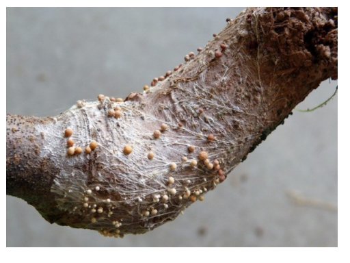
Figure 1. Southern blight fungus on a 4-year-old apple trunk.

The disease is most common on young apple trees but can affect apple trees of all ages when conditions are ideal. Hot temperatures and high levels of soil moisture favor disease development. Under these conditions the fungus can be seen growing on the base of the tree and along the soil surface. The fungus produces copious numbers of overwintering structures called sclerotia. The sclerotia are