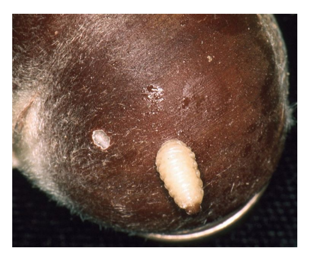
Figure 2. A chestnut weevil larva emerges from a chestnut shell.

Weevil management is critical to quality chestnut production in Ohio. Orchard sanitation is very important and can be the primary weevil control mechanism for a few backyard trees that are diligently harvested. All nuts should be harvested daily and immediately treated with either a specialized hot water bath or soaked for a week in ambient-temperature water. For larger commercial orchards, or situations where thorough daily harvest is not feasible, adult weevils can be sprayed at the time when they are actively laying eggs, typically in late August. Carbaryl is currently the only chemical labelled for chestnut weevils and must be applied with an air blast sprayer to coat the chestnut burs, which are found all around the top and edges of the tree crown.