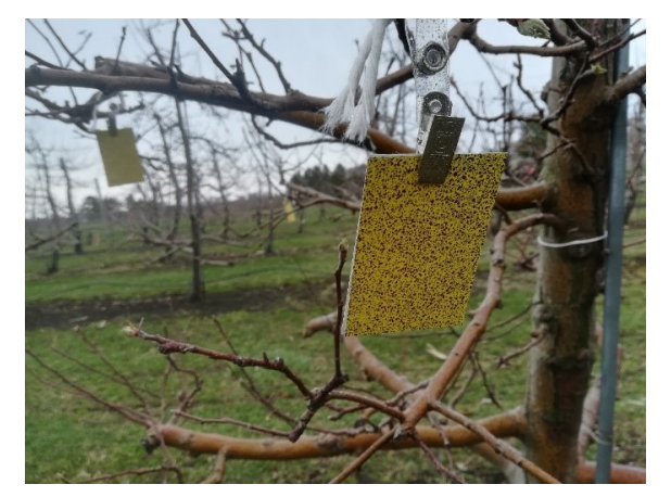
Figure 1. Spray coverage is the percentage of the crop surface on which spray droplets land. Water sensitive paper can be used to visualize coverage.

A long-standing tradition for apple growers, who typically use airblast sprayers, has been to spray pesticides until runoff – in other words, spray until the pesticides are dripping off the foliage.