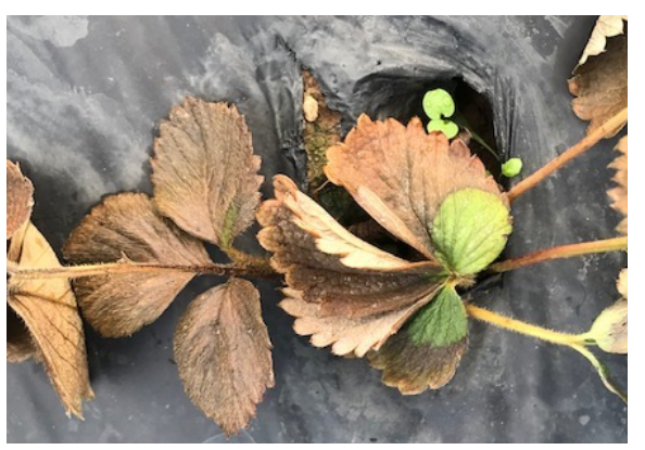
Figure 2. Late-stage foliar symptoms of Neopestalotiopsis disease.

The disease is favored by warm (60 to 85 degrees F) and wet (high humidity or rain) conditions. Spores (Figure 4) are dispersed by water splashing from overhead irrigation or rain. Working in the field when conditions are wet can also move the spores around the field. The fungus is most likely introduced into the field via infected but asymptomatic nursery transplants or bare roots as reported in Georgia and North It is unknown if the pathogen can Carolina. overwinter in northern environments such as New Jersey, Ohio or Ontario, Canada. The disease has been reported on 'Albion' and 'Ruby June' in Ontario and Ohio. respectively. Studies to determine the susceptibility of other varieties are