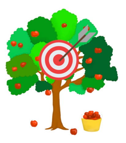
Figure 2. The intelligent sprayer uses sensors to target the tree canopy.

How low can you go when it comes to percent spray coverage on apples? Will 30% coverage do an adequate job on all pests and diseases, year in and year out? Field trials in many orchards, with many varieties, over multiple years will help us zero in on optimal coverage levels for efficiency and crop protection. Dr. Zhu and colleagues collected coverage and deposition data from apple tree canopies, comparing the performance of the Intelligent Sprayer and constant-rate airblast sprayers. They found that the Intelligent Sprayer had better uniformity in spray coverage than the standard airblast at multiple growth stages throughout the season. Intelligent Sprayer technology, with its superior spray deposition uniformity, may soon help growers to zero in on the Goldilocks zone.