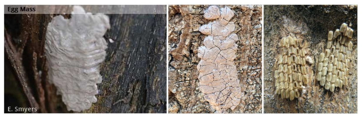
Figure 3. Spotted lantern fly egg masses take on a putty-like appearance at first and visually change over time.

The following statement is the shared statement from the Ohio ODA: