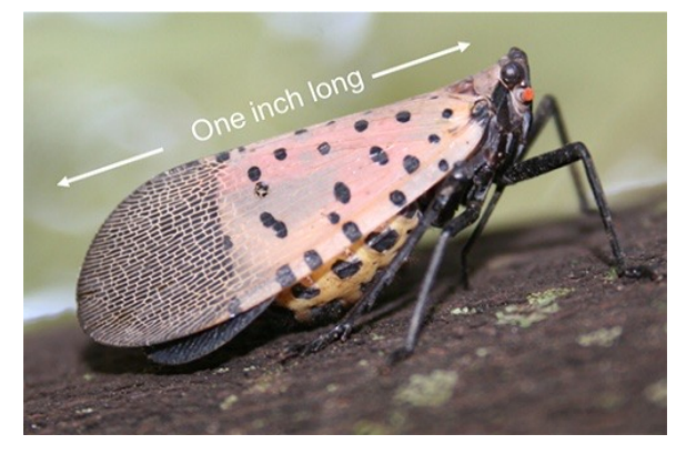
Figure 2. Adult spotted lantern fly. Continued on page 6

To date, SLF have not been found on Ohio farms. Help do your part to reduce the spread by having guests from known areas with SLF to inspect vehicles before arriving and departing your site!