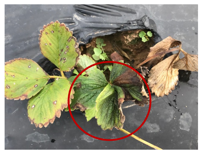
Figure 1. Foliar symptoms of Neopestalotiopsis disease are shown on the leaf in the red circle. Common leaf spot can be seen on the leaf outside of the red circle.

The start of the 2022 strawberry field season does not bring good news for Ohio strawberry growers. In 2017, researchers in Florida identified a new fungal pathogen affecting strawberries. Since then, the disease has been reported in Georgia, North Carolina, New Jersey, Ontario Canada, and now Ohio. The disease is caused by the fungus Neopestalotiopsis and for lack of a better name is called Neopestalotiopsis This fall, Neopestalotiopsis disease disease. symptoms were observed in a new strawberry planting in Ohio. The fungus can infect all parts of the strawberry plant - fruit, leaves, petioles, crown, and roots. In the Ohio planting the fungus was isolated from lesions on the leaves but not from the crowns. Leaf symptoms start as small brown lesions with light centers at the margins of the leaves (Figure 1). As the disease progresses, the lesions darken and expand to cover the entire leaf (Figure 2). The symptoms on the leaves can easily be confused with common leaf spot (Mycosphaerella fragariae), leaf scorch (Diplocarpon earlianum, Marssonina fragariae) and / or Phomopsis leaf blight (Phomopsis obscurans). However, Neopestalotiopsis disease symptoms progress much faster than those of common leaf spot,