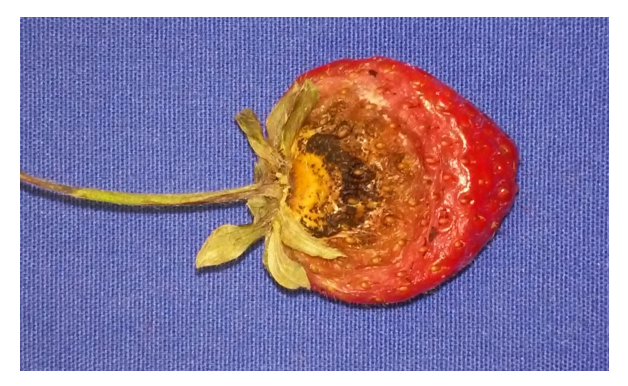
Figure 3. Signs and symptoms of Neopestalotiopsis spp.