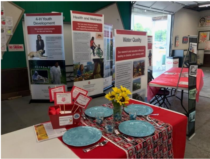
Dine In Display promotion, table set up at county fair

A table setting is an easy way to create a static display to promote Dine In Day. Obviously, this can be done in many ways. For the sake of keeping costs low and not displaying anything of high value or anything breakable, here are some easy options: