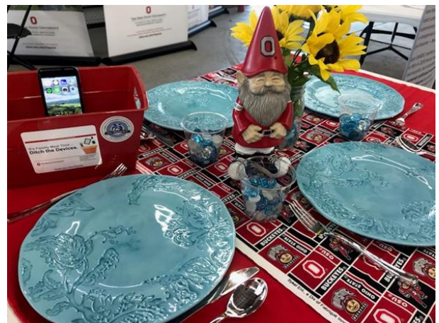
Dine In Display, using the technology bucket for phone parking spot