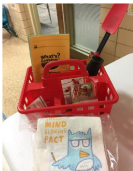
Pickaway County "Pick-A-Way" to Dine-In