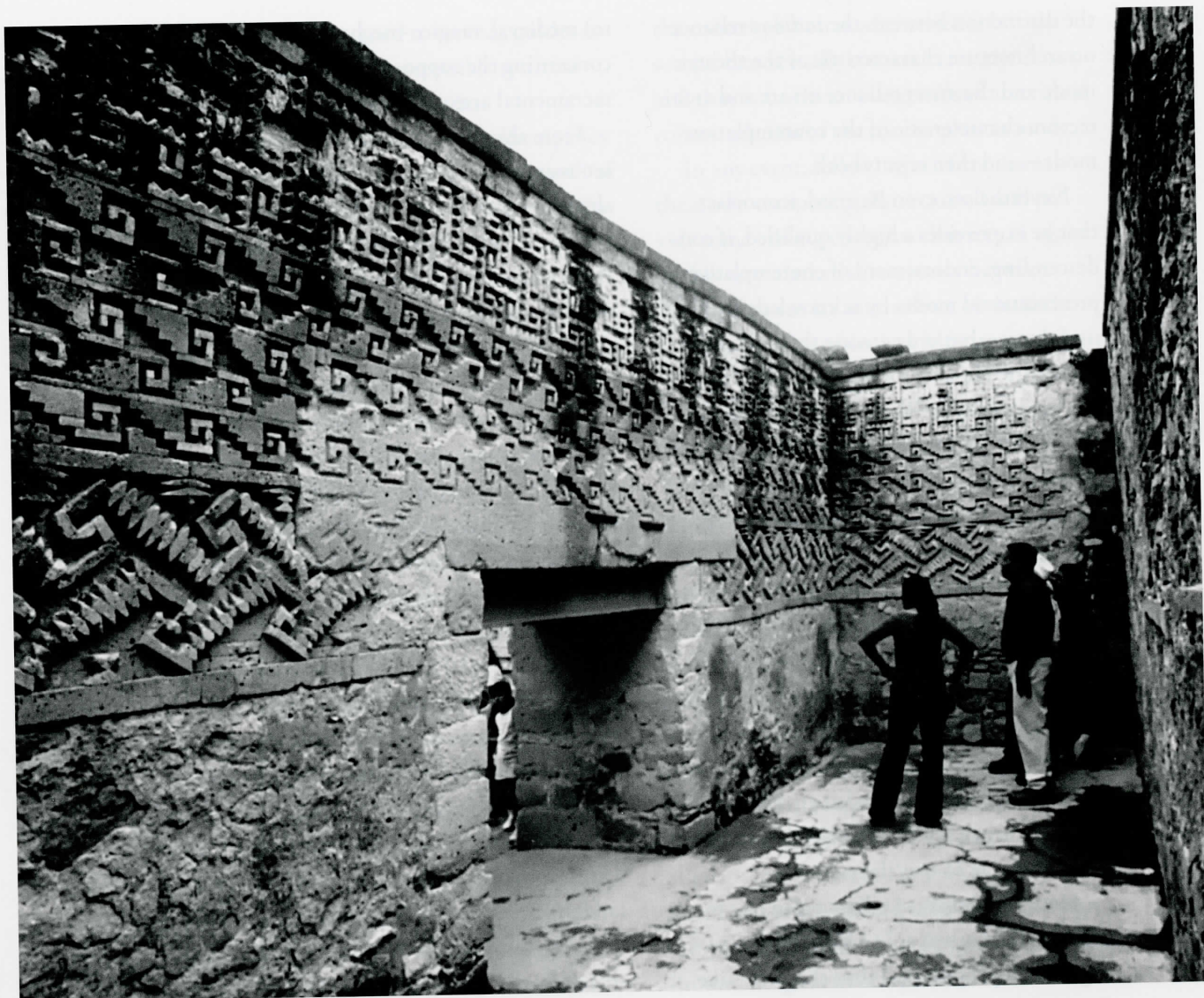
FIGURE 12-6. WHILE EVERY VISITOR TO THE ZAPOTEC-MIXTEC SITE OF MITLA SINCE THE EIGHTEENTH CENTURY HAS COMMENTED ON THE AMPLE AND DIVERSE GEOMETRIC DESIGNS THAT COVER MANY OF THE BUILDING FAÇADES, ALMOST NO ONE HAS SERIOUSLY ENTERTAINED THE PLAUSIBLE POSSIBILITY THAT THOSE INTRICATE DECORATIONS SERVED AS PROPS FOR DEVOTION IN THE SENSE THAT THEY WERE OBJECTS OF SUSTAINED "CONTEMPLATIVE" ATTENTION.