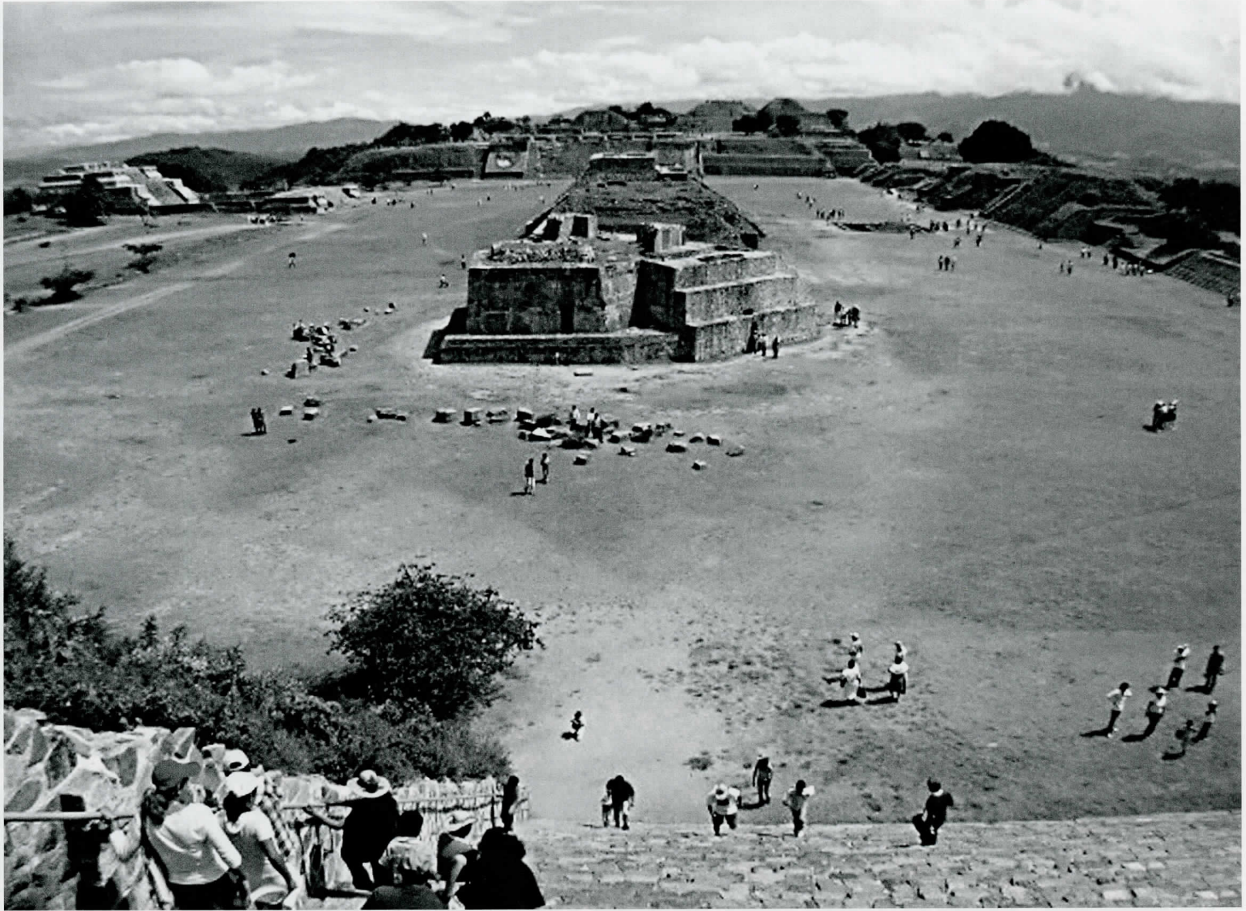
FIGURE 12-1. THE GREAT PLAZA AT THE ZAPOTEC SITE OF MONTE ALBÁN, OAXACA, A MESOAMERICAN SITE IN THE "THEATRIC MODE." SCHOLARS HAVE OFTEN CONCLUDED THAT THE BUILT FORMS PROVIDED THE STAGE-SETTING FOR DRAMATIC CEREMONIAL OCCASIONS THAT PRESUMABLY AROUSED MANY PARTICIPANTS AND ONLOOKERS TO TRANSFORMATIVE EXPERIENCES.

and stairways of Monte Albán, "the most grandiose of all American temple centers." 20 And likewise in the Aztec case, even William Prescott (1843), among the first to bring what he termed the "horrid wonders" of Aztec ritual to North American readers, despite his inclination to characterize the "barbarian"