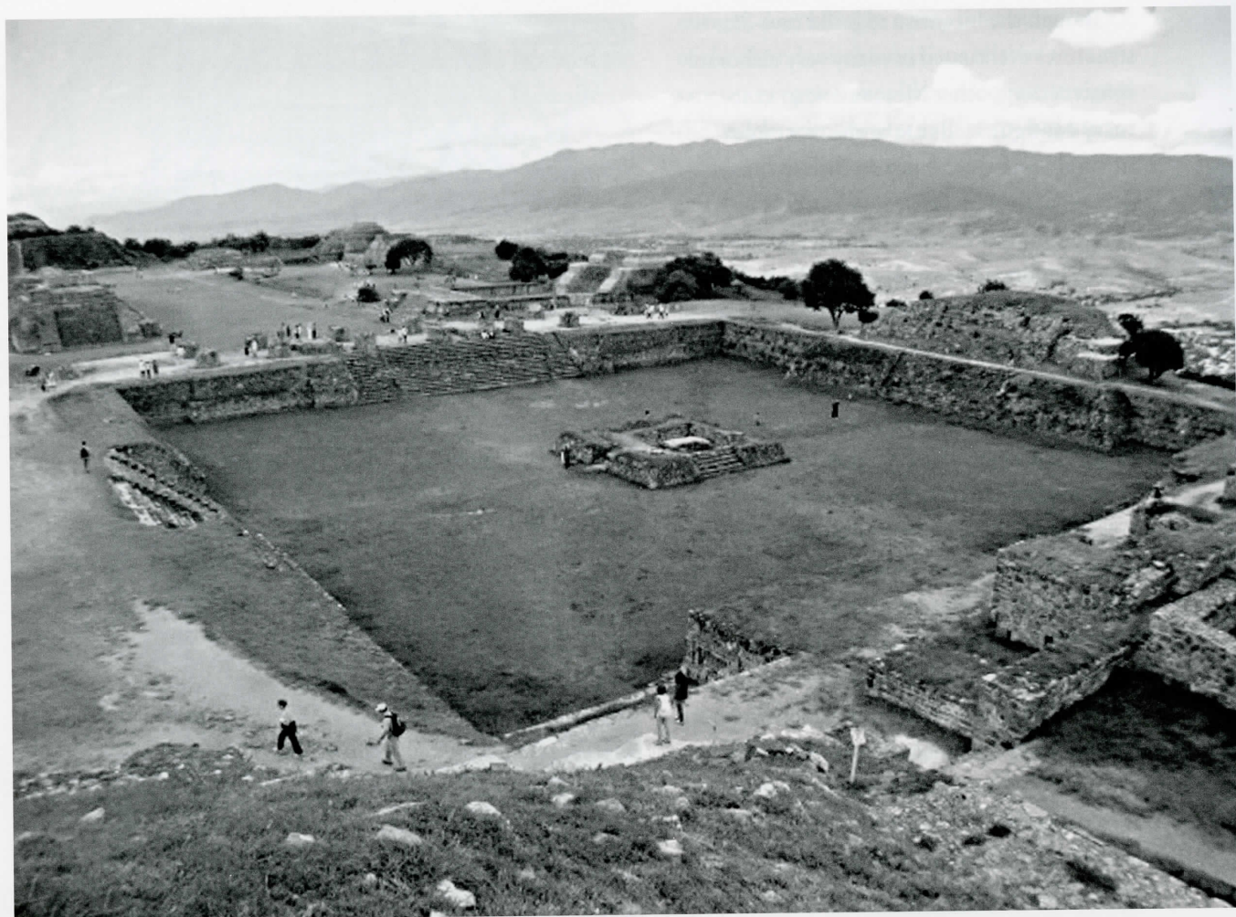
FIGURE 12-4. CONFIGURATIONS LIKE THE SUNKEN PATIO AT MONTE ALBÁN INSTANTIATE THE MUTUALLY SUPPORTIVE DESIGN STRATEGIES OF THE SANCTUARY MODE AND THE THEATRIC MODE. ALL WHO ASSEMBLE WITHIN THE RECESSED PLAZA ARE URGED TO TRAIN THEIR ATTENTIONS ON RITUAL PERFORMANCES THAT OCCUR ON THE CENTRAL PLATFORM.