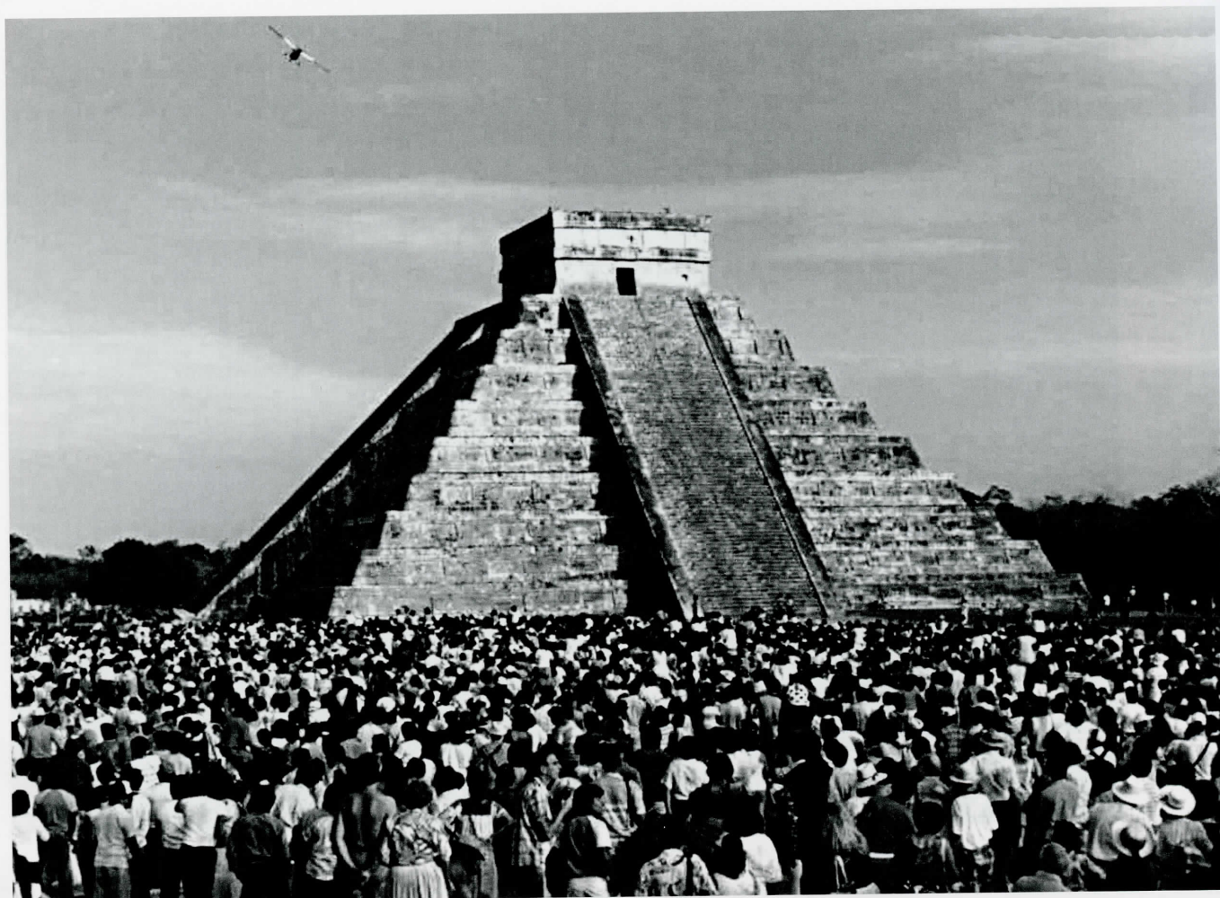
FIGURE 12-2. THE GREAT PLAZA OF CHICHÉN ITZÁ CAN COMFORTABLY ACCOMMODATE THE MORE THAN THIRTY THOUSAND VISITORS WHO ATTEND THE DESCENT OF THE "SERPENT OF LIGHT" ALONG THE BALUSTRADE OF THE MAIN CASTILLO PYRAMID EACH SPRING EQUINOX. SUCH ARCHITECTURAL SPACES WERE SITES OF THE CEREMONIAL EVENTS CHARACTERISTIC OF THE THEATRIC MODE.