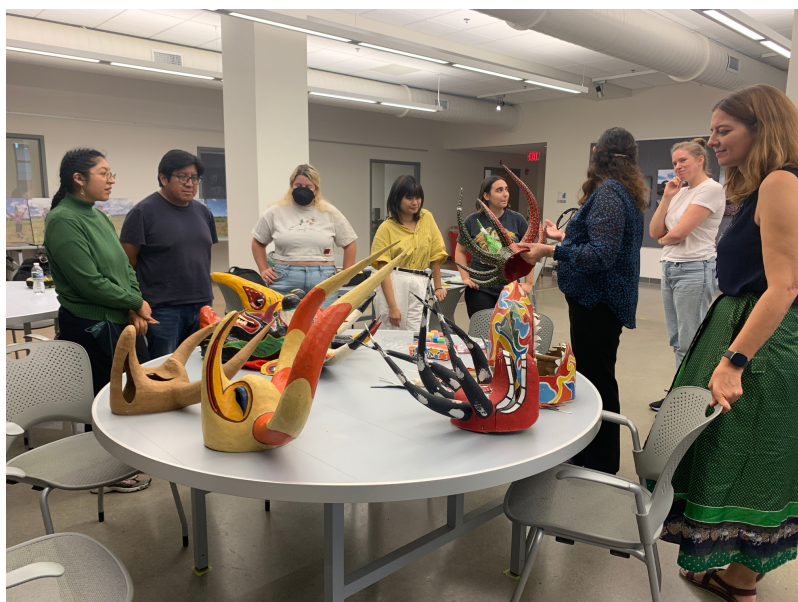
Kawsay waqaychaqkuna student curators preparing to install the diablo masks