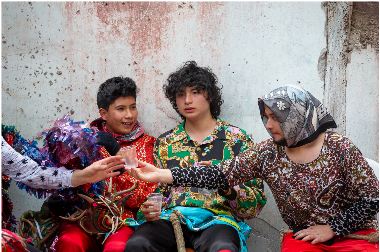
Leonardo Carrizo, Untitled (2017), Tungurahua, Ecuador, Digital Photograph

Carrizo's photographs document the procession of a traditional partida (group) from the Tunguipamba community in Ecuador as they travel together into the center of Píllaro. The performers will conduct on average two processions and performances per day for six days in a row!