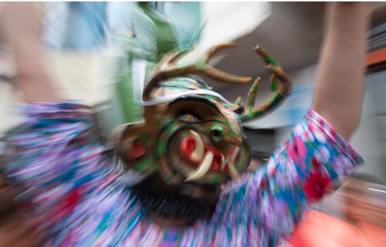
Leonardo Carrizo, Untitled (2017), Tungurahua, Ecuador, Digital Photograph