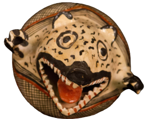
Detail of Coati Mundi ( cucuchu ) ceramic figurine by Apache Vargas