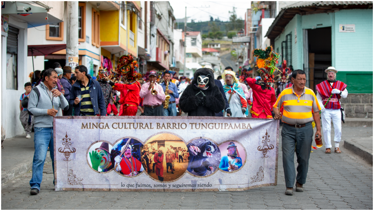
Leonardo Carrizo, Untitled (2017), Tungurahua, Ecuador, Digital Photograph

Carrizo's photographs document the procession of a traditional partida (group) from the Tunguipamba community in Ecuador as they travel together into the center of Píllaro. The performers will conduct on average two processions and performances per day for six days in a row!