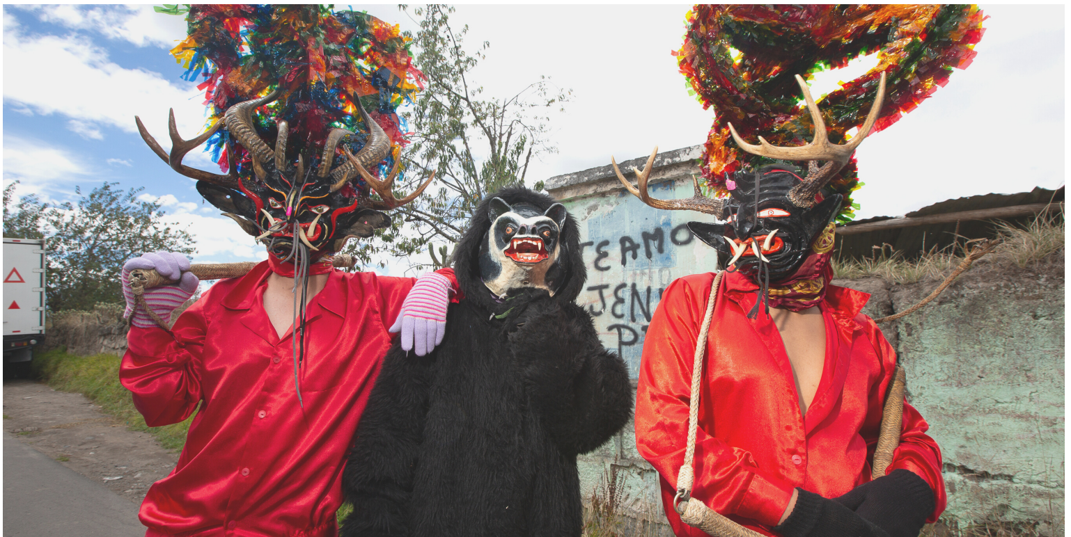
Leonardo Carrizo, Untitled (2017), Tungurahua, Ecuador, Digital Photograph

Diablada festivals are among the most widely recognized celebrations in Latin America. These celebrations feature several masked characters, most noticeably the diablos (devils).