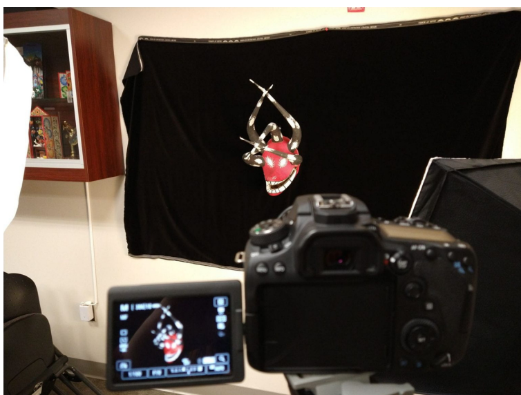
Documentation process for photographing a Diablo mask

Since March 2020, the COVID-19 pandemic has taken a devastating toll on Latin America and the world. At certain times countries like Brazil and Peru had the highest levels of confirmed cases and deaths globally. Areas of Ecuador such as Guayaquil and Quito also suffered devastating losses. Please keep these global communities in mind as you engage with this exhibit.