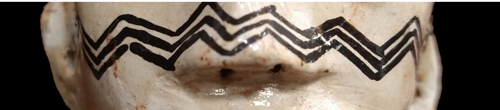
Detail of Sungui - Yacu Mama ceramic figurine by Rosa Dagua