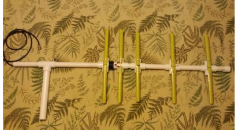
Today's design (source: CCARS and W4ULB )