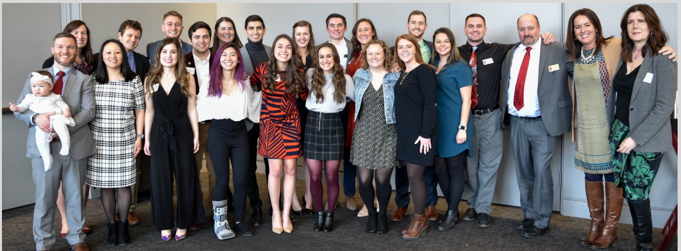
Stater Alumni at Banquet