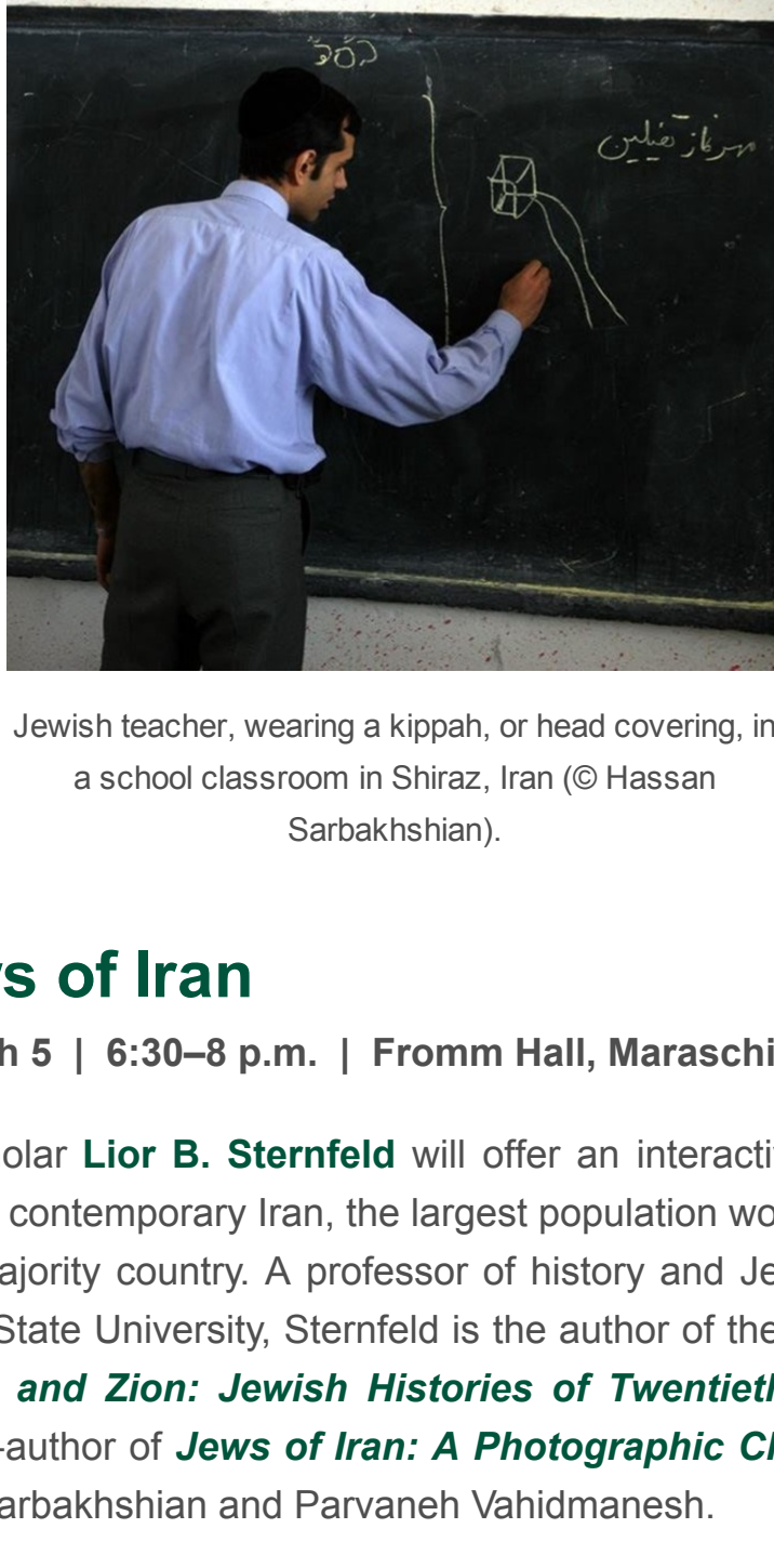
Jewish teacher, wearing a kippah, or head covering, in a school classroom in Shiraz, Iran.