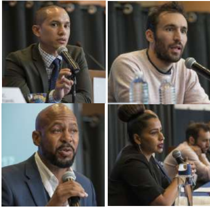
Panel 3—Friday, November 3, 2017