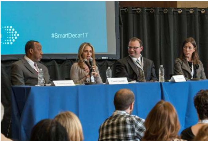
Panel 1—Friday, November 3, 2017