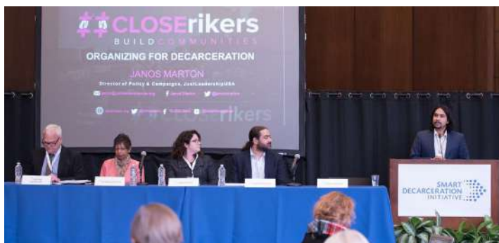
Panel 5—Saturday, November 4, 2017