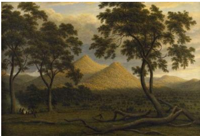
John Glover, "Constitution Hill at Sunset, Van Dieman's Land," 1840

The Northeast Victorian Studies Association invites papers for its annual conference; the topic this year is Victorian Outliers .