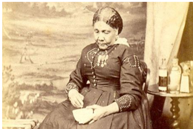
Mary Seacole

"the 10,000 hour rule" Opportunity and talent Circumstance and capability "the rich get richer and the poor get poorer" ( "The Matthew Effect" ) Birthdate/fortuitous timing Anecdotal evidence False dichotomies