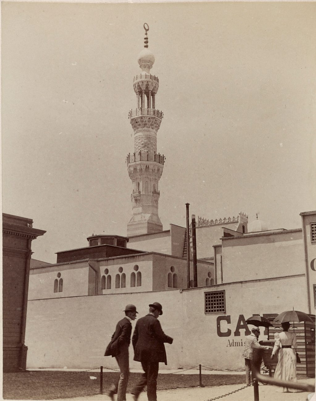
Entrance to Street of Cairo section of the Midway at the 1893 World's Columbian Exposition, Chicago, Illinois