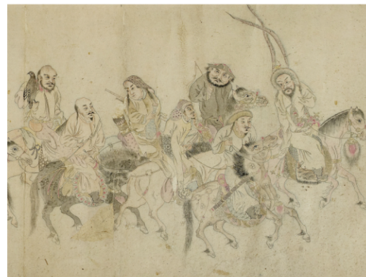
Image: Detail of The Hawk Hunt , Qianlong period, AD 1776, China, Shaanxi Province, Xi'an. Cat. No. 116088

The name Han has historic origins: the Han Dynasty is considered to be one of the earliest dynasties. The Han Dynasty followed the Qin Dynasty, which unified China for the first time. Before this, China was