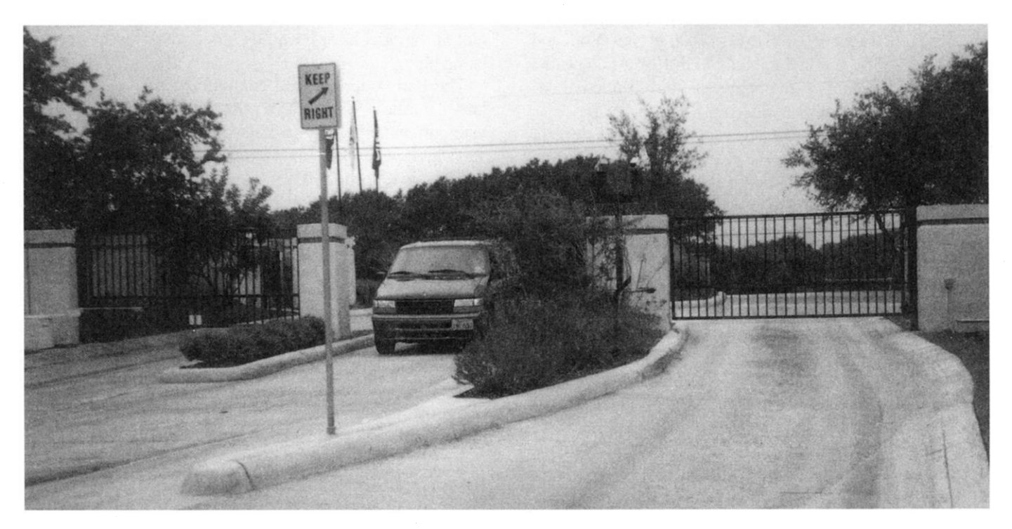
Figure 1. Gated entry.

New suburban housing developments with surrounding walls and restrictive gates located approximately thirty minutes drive from their respective downtown city halls were selected at the edge of each city. Single-family house