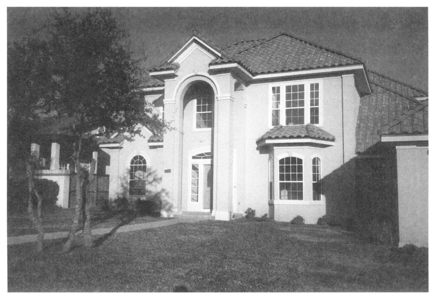
Figure 3. Scottsdale-style house.

communities, interviews with key informants such as the developers and real estate agents, and the collection of marketing, sales, and advertising documents. An unstructured interview guide was developed to elicit residents' decision-making processes concerning their move to the gated community. The research team<sup>7</sup> collected field notes and interviews in the New York area, while I worked alone in San Antonio. The interviews lasted between one to two hours, depending on whether the interviewer was taken on a tour of the house. We did not ask to be taken on a tour, but many times interviewees offered, and we used the tour to learn more about the person's tastes, interests, and preferences.