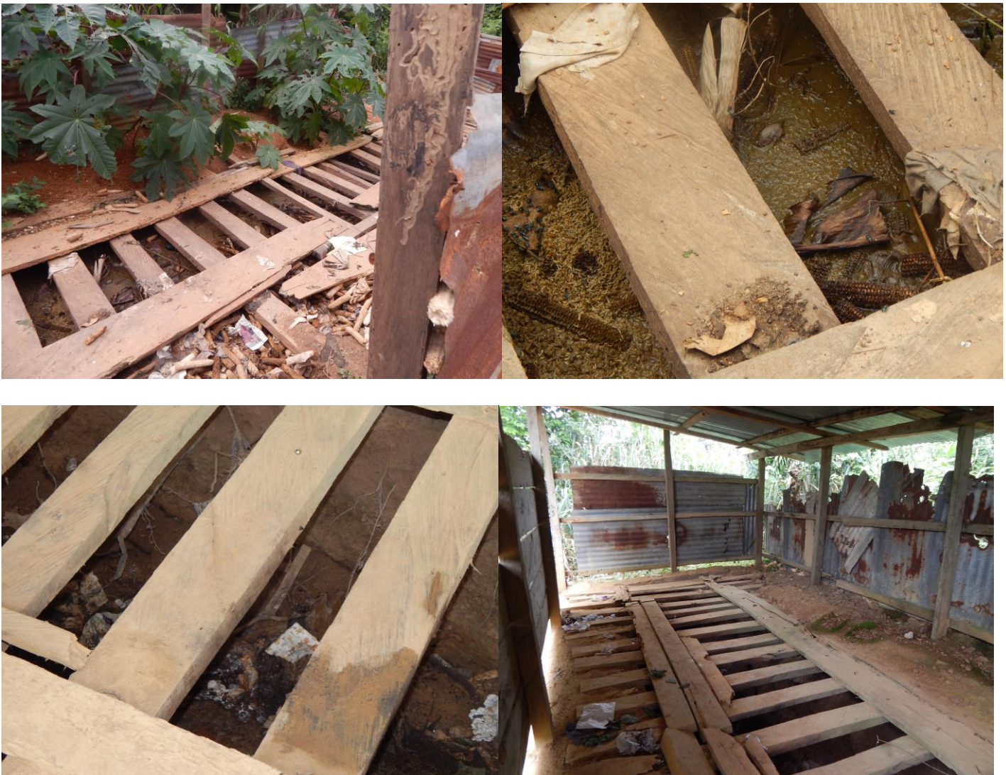
Top: Community toilet facilities in Bonkwaso. Bottom: Community toilet facilities in Abesua.

The construction of more sustainable and sanitary toilet facilities is necessary in Bonkwaso and Abesua. An educational component to such an initiative would be essential to increase the adoption and maintenance of the new facilities.