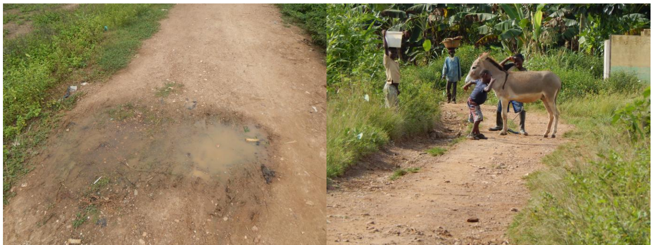
Left: Road running through Bonkwaso. Right: Road leading into Abesua.

Improving/upgrading (e.g. widening and surfacing) of the existing roads leading to Abesua and Bonkwaso from Mankranso could make existing transport become cheaper, faster, more frequent, more reliable and safer, and could also encourage new transport services in the area. The increased accessibility could have a positive effect on the health and economic conditions in the communities.