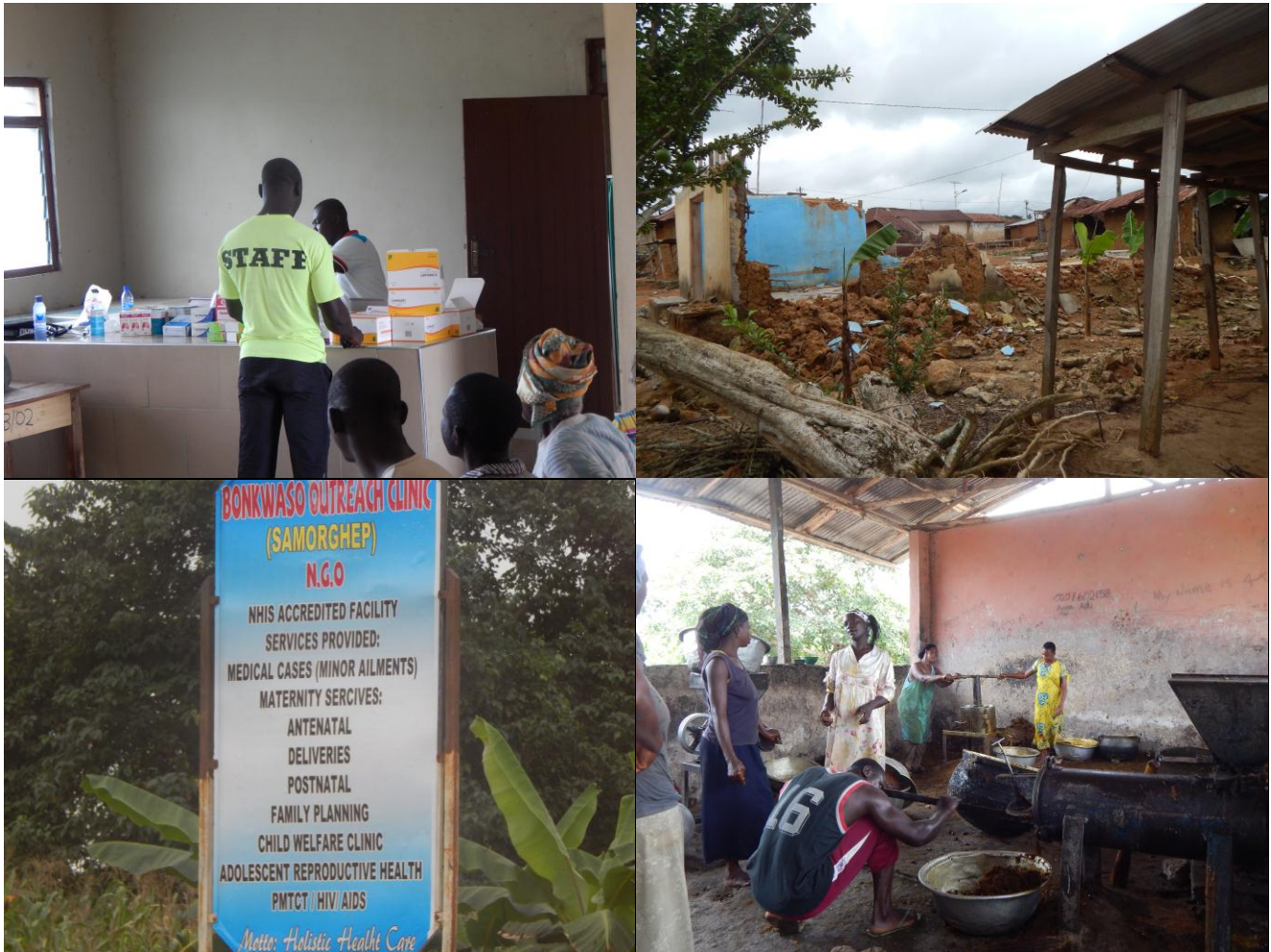
Top left: Mobile clinic in Abesua.