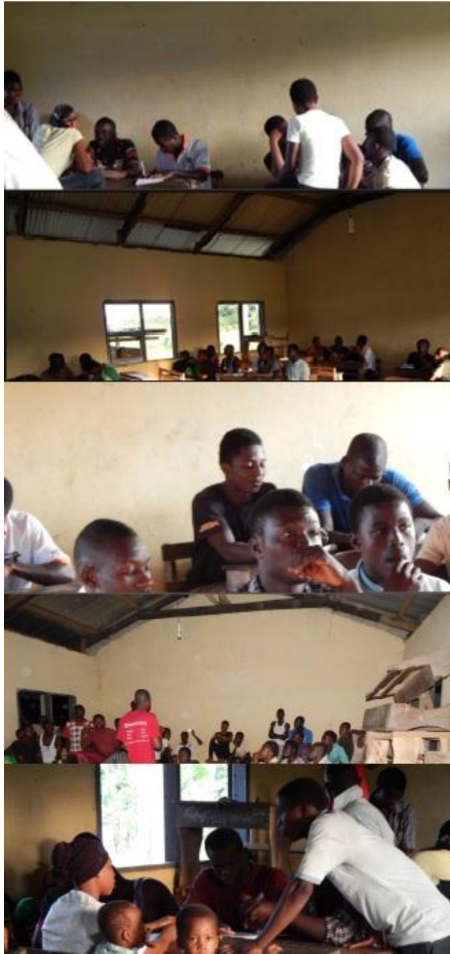
Abesua youth workshop