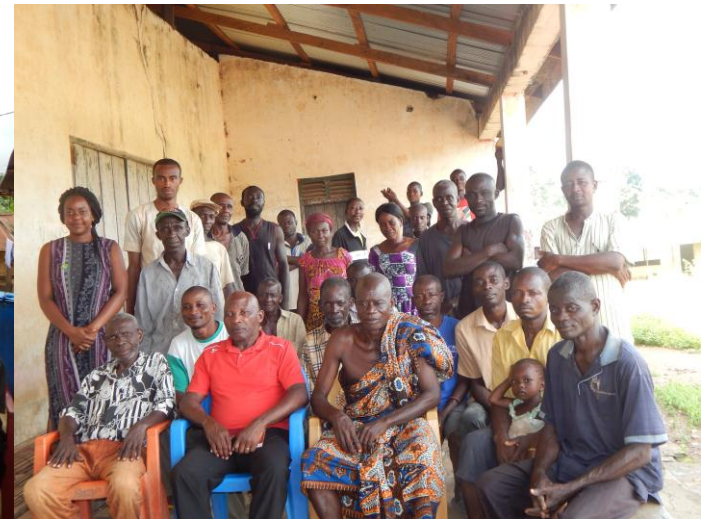
Top left: Introductions between the Researchers and community leaders in Bonkwaso.