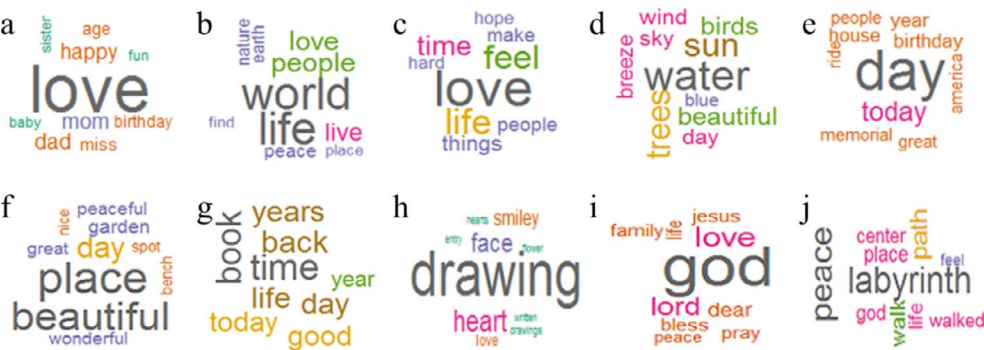
Fig. 1. Word clouds generated from topic-word proportions, as displayed to participants for labeling, and resultant descriptors: a. Family; b. World & Peace; c. Life & Emotions; d. Nature; e. Celebration; f. Park; g. Time & Memories; h. Art; i. Religion; j. Spiritual & Life Journey.