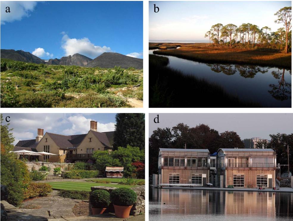
Fig. 4. Sample images for each stimuli group a. High Naturalness + High NSED b. High Naturalness + Low NSED c. Low Naturalness + High NSED d. Low Naturalness + Low NSED.