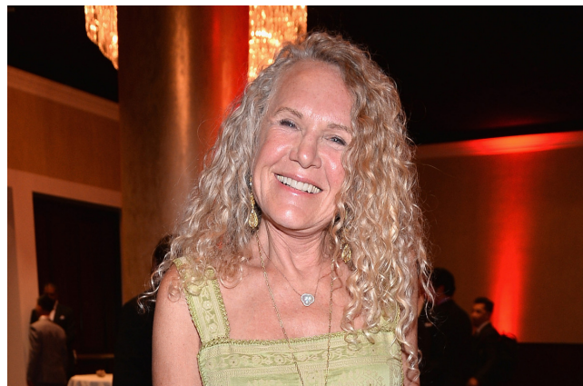
Christy Walton.

November 6, 2015 — 6:24 AM PST Updated on November 6, 2015 — 8:24 AM PST