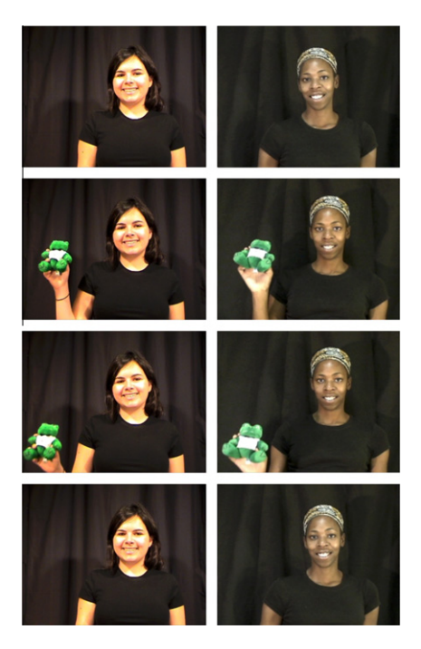
Fig. 1. Images of the White and Black actresses in Experiment 1. These same individuals were featured in all three experiments.

On each of four test trials, infants saw a toy choice event, with both White and Black individuals pictured simultaneously offering a toy to the infant. Just at the moment when the toys disappeared off screen, two real toys "magically" appeared from behind the table for the infant to grasp, giving the illusion that they emerged from the screen. The objects were attached by Velcro to PVC piping that rotated from behind the table, and landed on the table equidistant from the infant and in front of the silent and motionless images of the two individuals. Half of participants saw only these four toy choice events; half of participants saw each toy offering event preceded by speaking trials, in which each individual engaged in infant-directed native speech. The ordering and lateral positions of the White and Black individuals were counterbalanced across infants in each condition, and the individuals reversed sides after the second trial. Infants' first reach during a