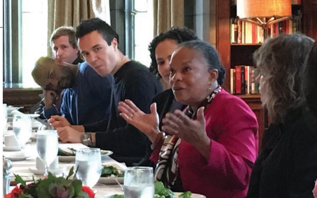
Christiane Taubira (former French Minister of Justice) engaged in conversation over lunch with UChicago students, faculty, and Consular officials.

In 2017, the FACCTS program received a total of 25 applications, with applicants requesting a total of $545,766. Fifteen projects were selected—seven in the Physical Sciences, five in the Biological Sciences, two at Argonne National Laboratory, and one at Fermilab—each receiving commitments ranging from $7,200 and $24,900. A total of $241,400 was committed to the projects described in the table on page 10.