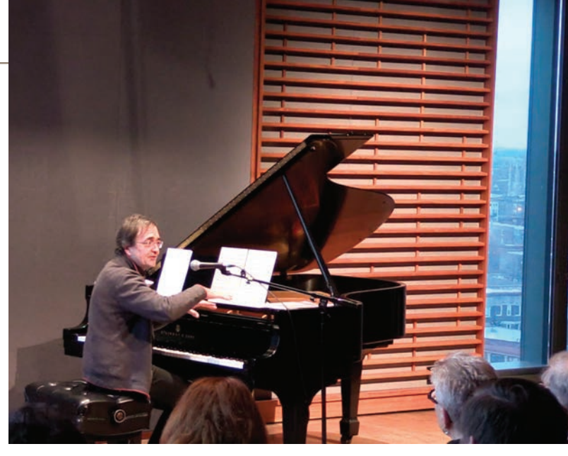
Pierre-Laurent Aimard during a lecture-demonstration at the Logan Center.

French pianist, Pierre-Laurent Aimard, performed works by Ligeti (Etudes) and Beethoven (Sonata #29, Op 106). March 6, 2018, in the Performance Hall at the Logan Center for the Arts.