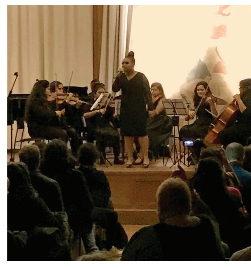
After School Matters conference participants in concert at the Fondation des Etats-Unis in Paris.

After School Matters, and local support was provided by the University of Chicago Center in Paris.