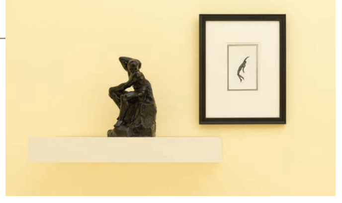
Installation view of The Hysterical Material, showing Auguste Rodin's Titan I, 1879-80, and Demon in Space, 1897.

With the participation of scholars Dominique Malaquais (CNRS) and François Vergès (Goldsmith College London). Returns considered the aesthetic and sociopolitical ramifications of Pan-Africanist movements of the early to mid-20th century, which sought to garner connectedness and solidarity among Africans on the continent and those of African descent across the globe.