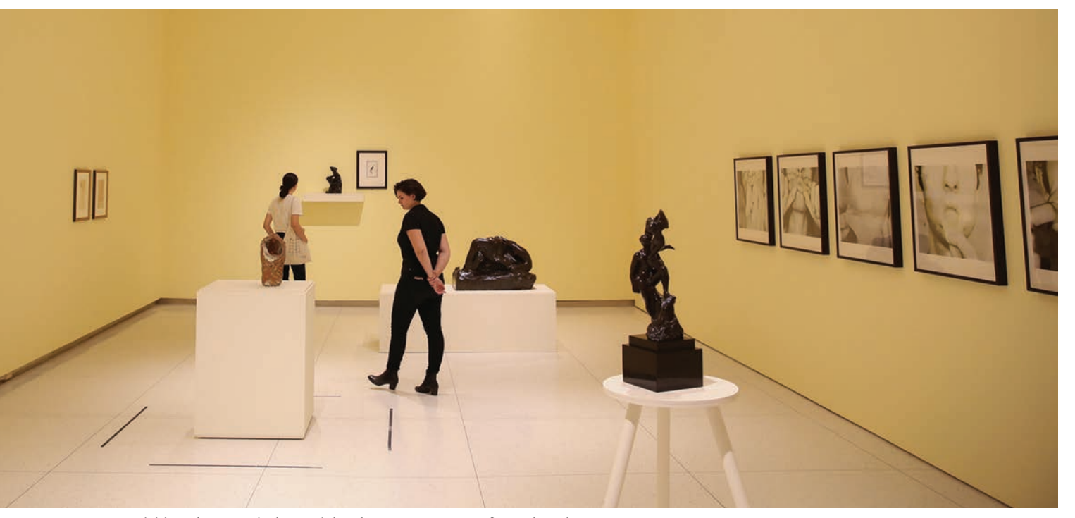
Guests visiting The Hysterical Material at the Smart Museum of Art.