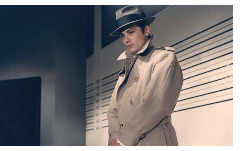
Alain Delon in Le Samouraï , screened at Doc Films on February 7, 2018.