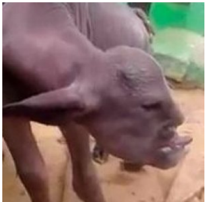
'Demon Goat' Terrifies Village With Human-