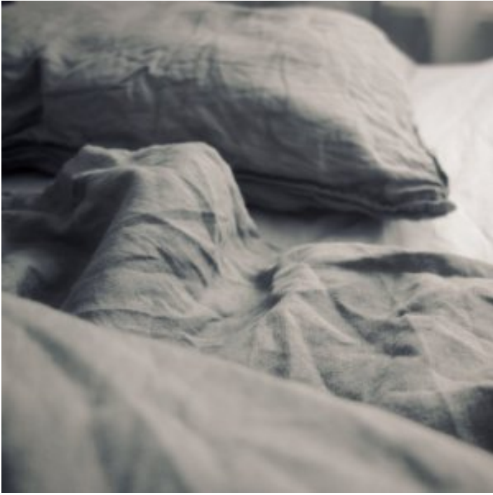
The Real Reason Humans Need to Sleep Under Blankets