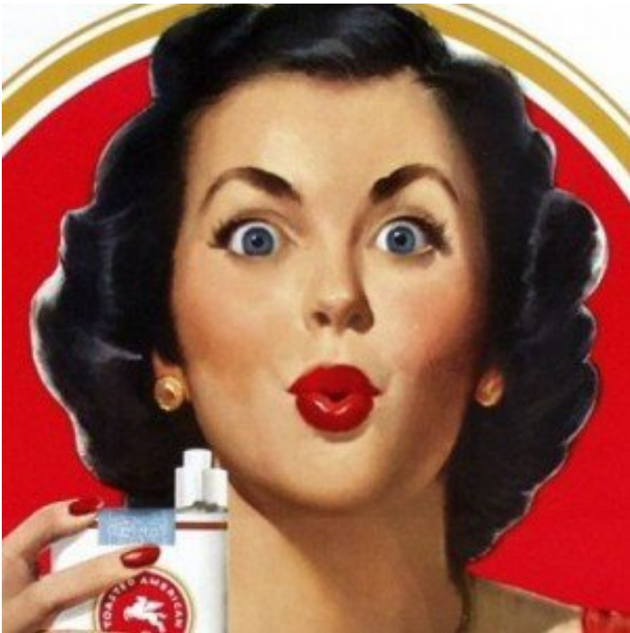
Things People Believed 50 Years Ago That Were Completely Wrong