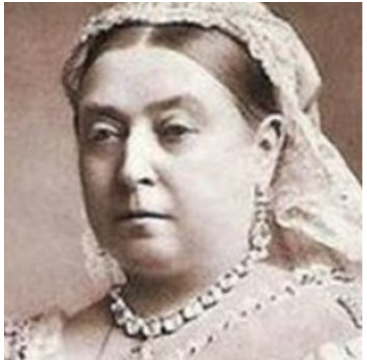
Messed Up Things You Never Knew Happened in the Victorian Era

Your opinion matters -- voice it in the comments below!