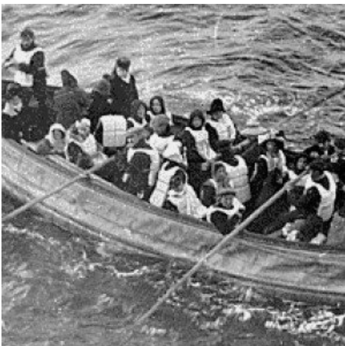
Titanic Artifacts Reveal Gruesome Discovery