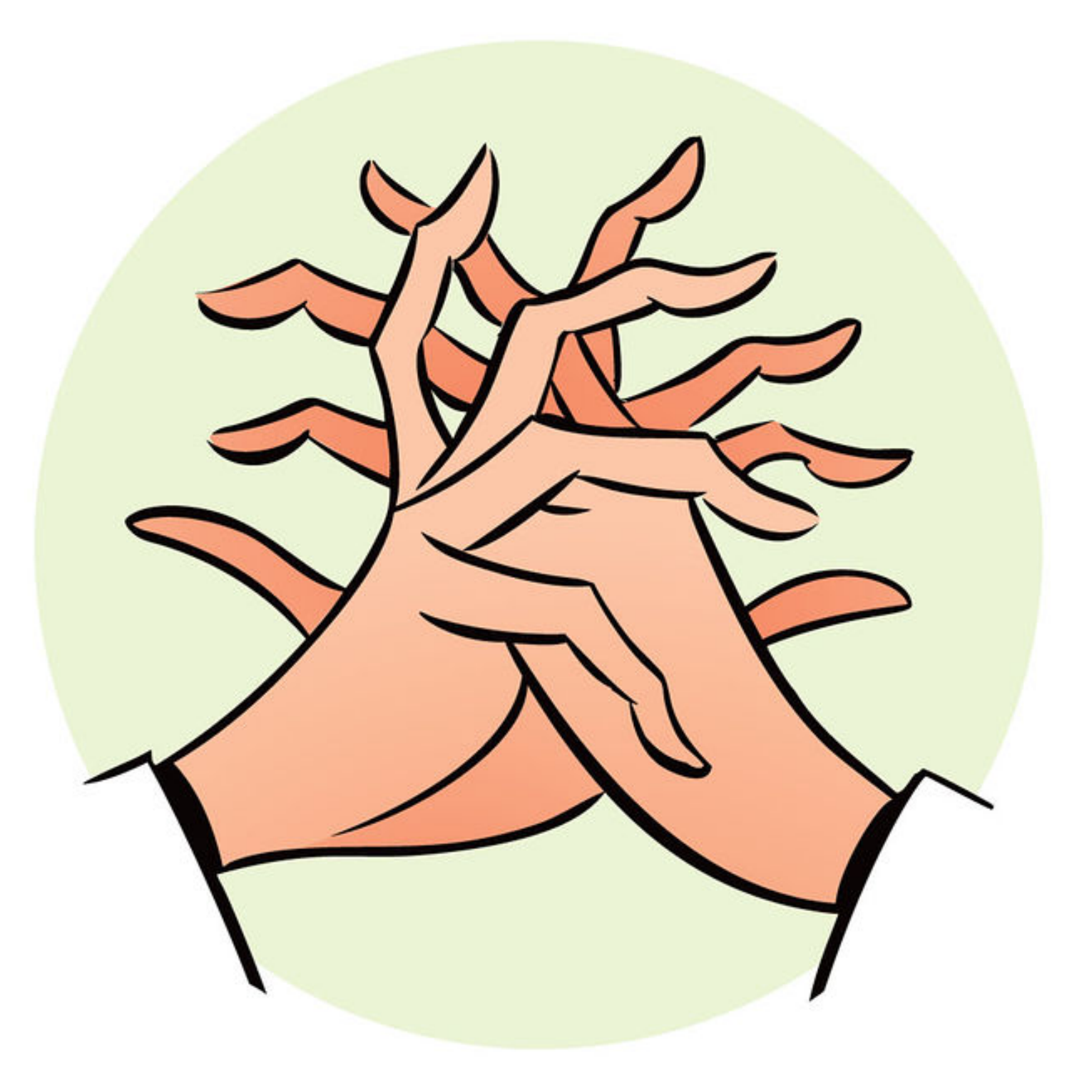
Hold your hands free and relaxed at your sides, without fidgeting.

This poses a challenge to anyone who must gain others' trust to perform well in meetings, interviews or other gatherings.