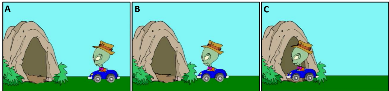
Figure 1. Still frames taken from the start (A) midpoint (B) and endpoint (C) of a motion event. In this example, an alien (agent) driving a car (manner) moves across the screen and into the mouth of a cave (path).

Stimuli were 24 short videos of animated clip art drawings. Target trials included 12 motion events in which a human or animal agent moved with the assistance of an instrument to reach a landmark representing a path endpoint. Still frames from the beginning, middle, and end of one of the target events can be seen in Fig. 1: in the clip that these images are taken from, the alien driving a car moved across the scene space from right to left, ending in the mouth of the cave. Distinct visual elements represented the manner and path components in each event. The manner of motion was represented by an instrument or vehicle (e.g., driving a car, riding a motorcycle) and the agent rode on or in this instrument toward a static landmark that determined the actual path (e.g., into a cave, to a carwash).