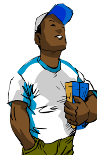
Dealing With Zeke