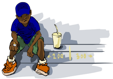
My Hot Dog

Pick your favorite story from this chapter. Then read through it again and take notes about it on the next page. When you are done reading, you will use your notes to write a summary.