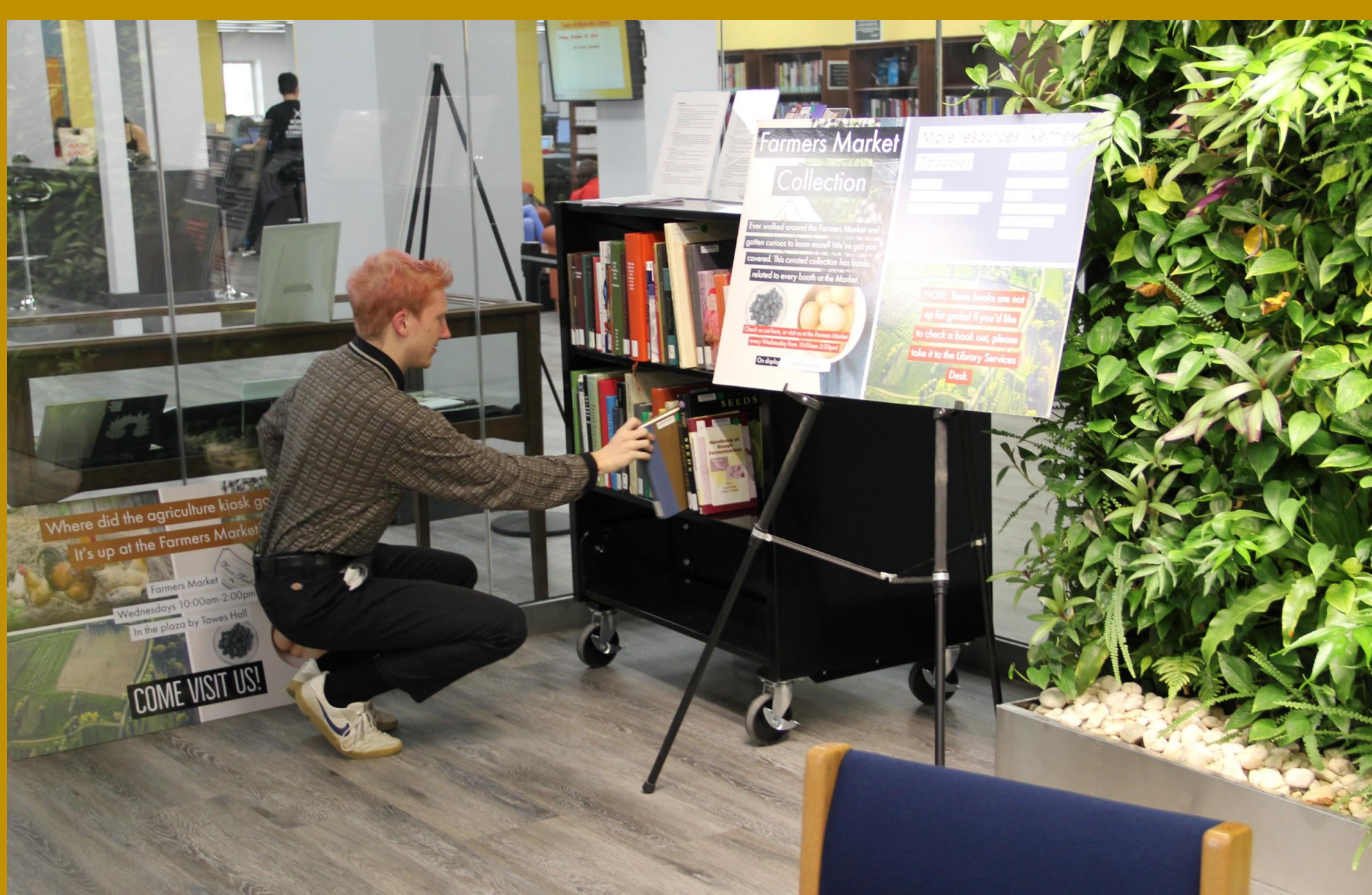
A student browses the Farmers Market collection in the kiosk's lobby location, next to the Biowall.