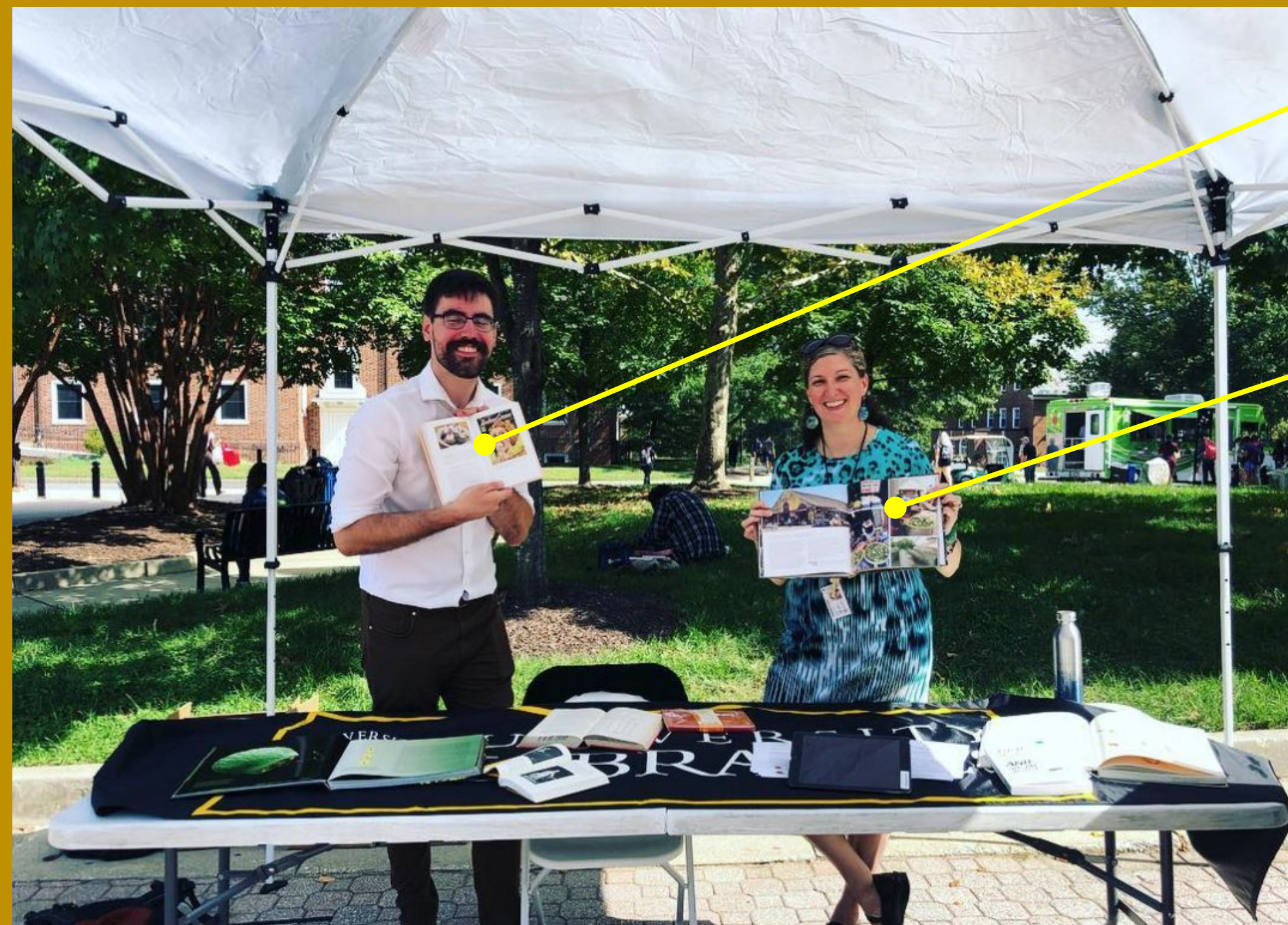
The authors showing off some of the materials at their Farmers Market table.