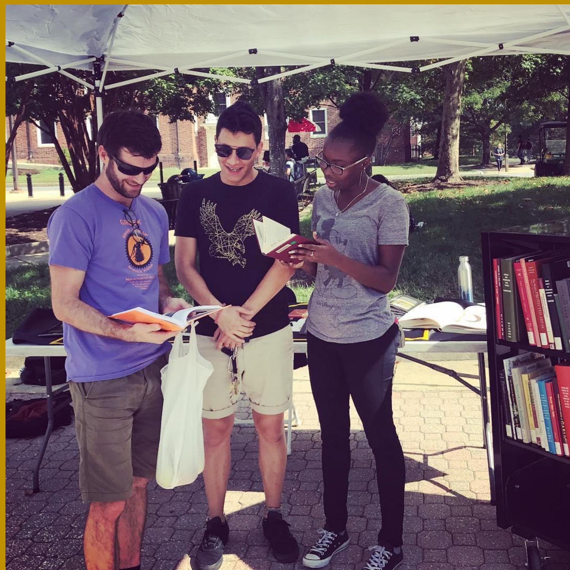
Students read through library materials at the Farmers Market.