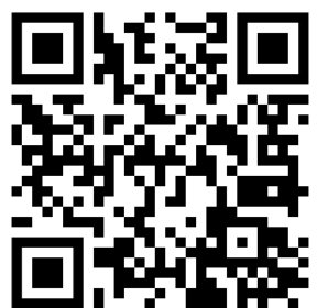
WPI eProject site for PC

If you want to experience and deliver real-world Tech solutions in the fast-paced Financial industry via FinTech projects, then this is the MQP for you!