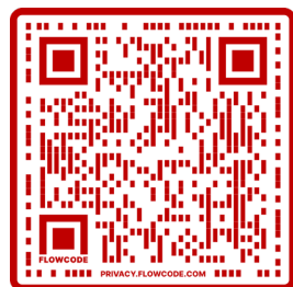
Overview video of the Project Center