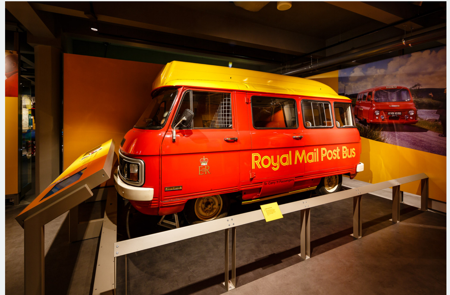
The Postal Museum