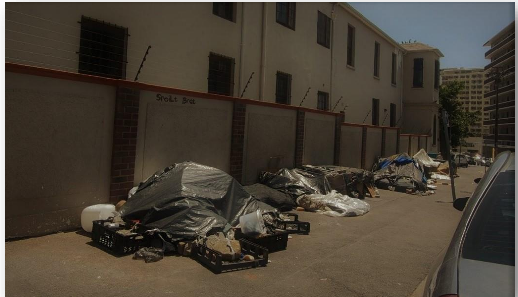
Picture of temporary shelters near The Hope Exchange