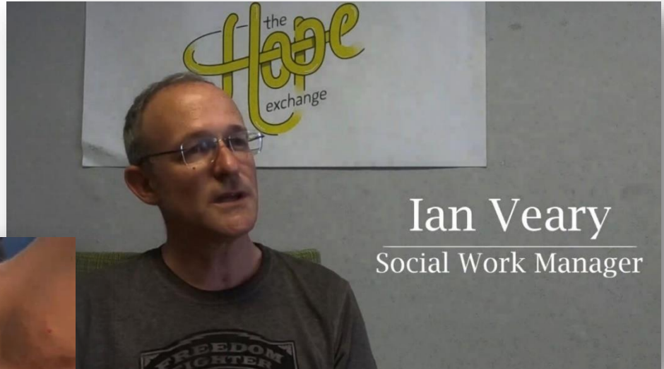
Clips from our video for The Hope Exchange

the street people that we know, their personalities, their positivity, and their faith. Through this video we hoped to spread the message encouraging the public to donate to The Hope Exchange and other advocacy groups that support street people.