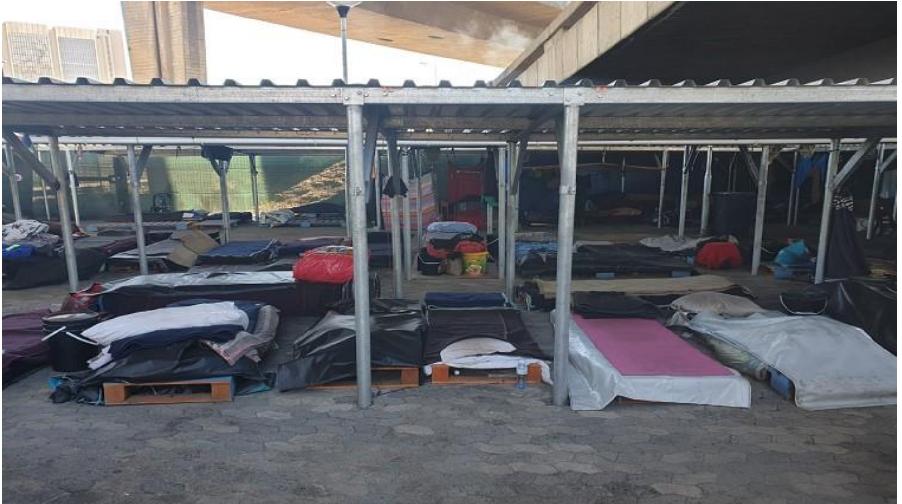
Figure 4: City funded Safe Space located under the Culemborg Bridge, currently housing over 200 people who would otherwise be on the streets, courtesy of SABC News.