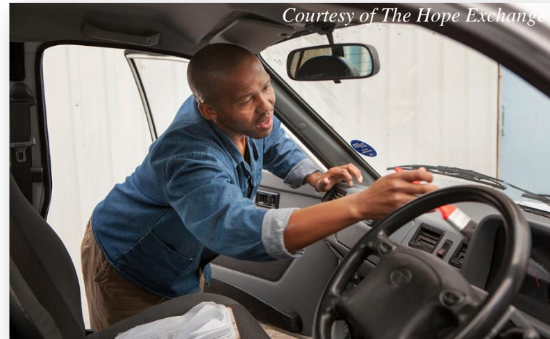
The Car Wash at The Hope Exchange provides employment for many clients