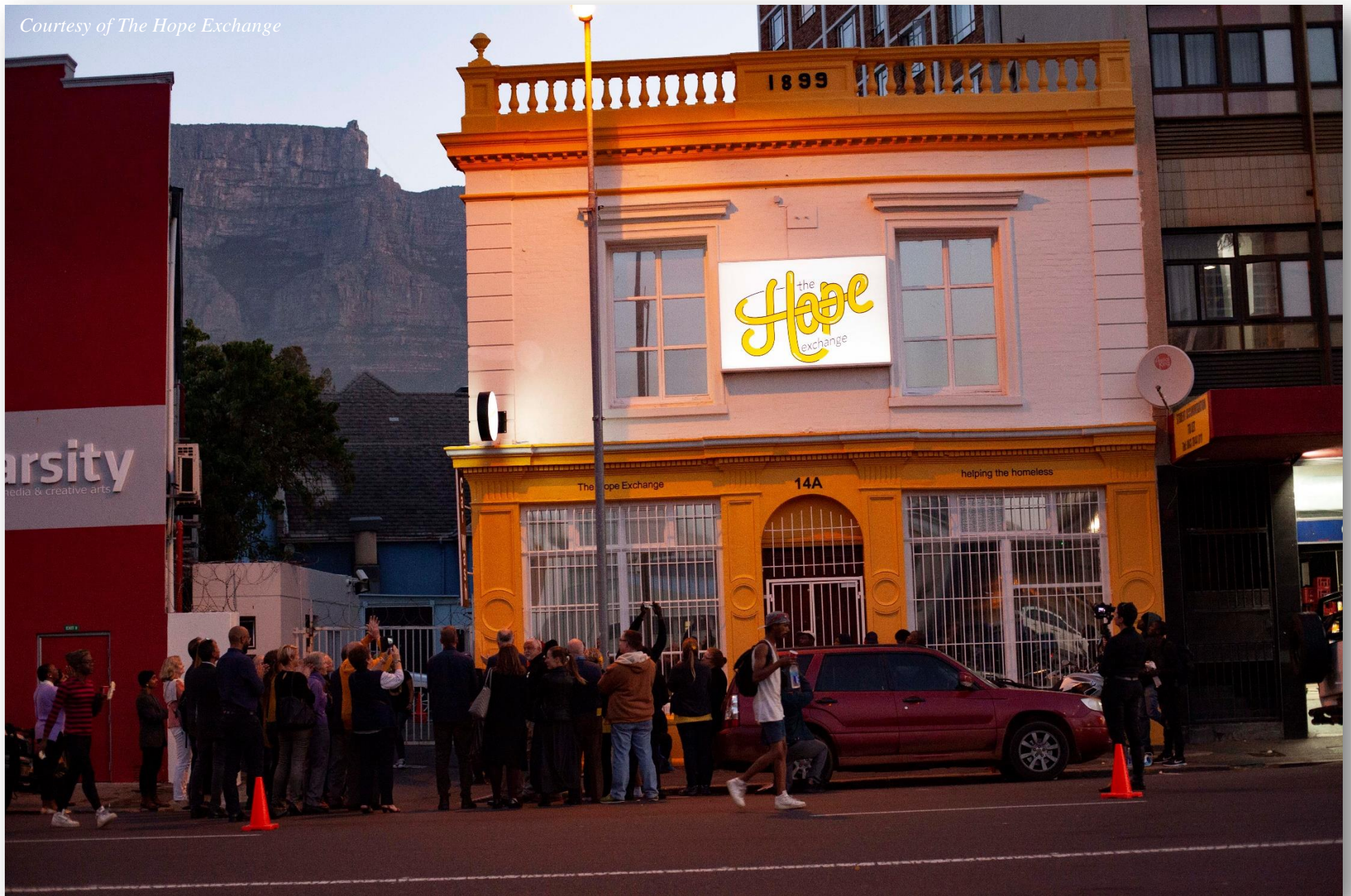
Picture of The Hope Exchange