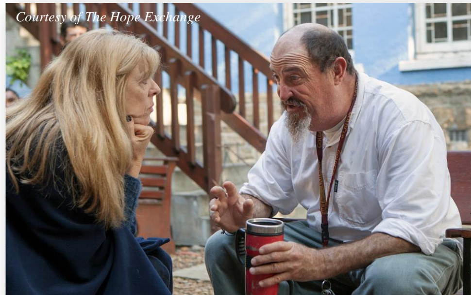
Social worker with client at The Hope Exchange

A combined approach, where rehabilitation and reintegration happen simultaneously might be appropriate for some people. Reintegration and rehabilitation often times cannot be separated and require simultaneous implementation. Regardless of the approach, all NGOs and government officials that we interviewed recognize that both aspects are crucial to resolving homelessness. We conclude that each case of homelessness is unique and must be analyzed independently in order to maximize success. Rather than prioritizing reintegration, rehabilitation, or a strict combination, we recommend individualization because homelessness is so complex and far-reaching. Developing personal reintegration/rehabilitation plans for street people should be a task for social workers, peace officers, and NGOs.