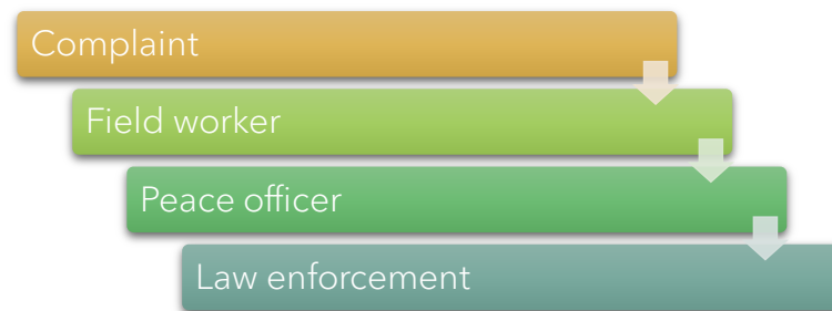
Figure 5: Protocol for interaction with a street person, according to City of Cape Town Officials.

In addition, we found cases where law enforcement acted brutally towards street people. One man said that he was smacked in the face several times for smoking marijuana. He also said that police have threatened to spray them with water if they do not move off the street. Another said that he had been tear-gassed by law enforcement for taking shelter in a public area. Many interviewees described law enforcement as judgmental and dismissive towards street people. One street person called law enforcement “crazy”. Law enforcement may not be aware of the protocol that they are meant to follow. The protocol that Councillor Badroodien and Ms. Frost explained is not clearly outlined in the policy, leading to a lack of accountability for law enforcement.