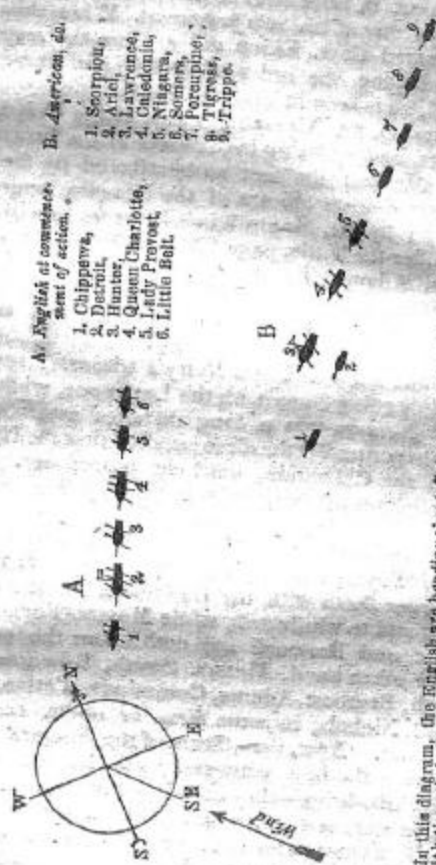
DIAGRAM NO. I.

In this diagram, the English are heading about S. S. W., a little off, lying to, the Americans about S. W., or with the wind abeam. The distance cannot well be represented here, but the reader will imagine the leading American vessel to be about a mile from the enemy, and the sternmost more than two. The Lawrence having made sail is leaving the Caledonia. The witnesses who testify against Capt. Elliott evidently think to ought to have passed the Caledonia, in this stage of the battle, without orders."