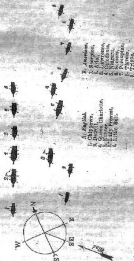
DIAGRAM NO. II.

In this diagram the Lawrence is lying abreast of the English ships, hence to No. 5, the Niagara, has passed No. 4, the Caledonia, and the vessels astern are endeavoring to get down. The diagram is not accurate on account of the small space on which the diagram is drawn, but the intention is to represent the Lawrence at about a quarter of a mile from the enemy, and the Niagara nearly as far astern of her. The Niagara, Caledonia, &c. are all placed a little too far to leeward in this diagram. The four stoutest American vessels, at this period of the action, were probably a mile and a half from the enemy, but making the shot of their long heavy guns tell. At this period of the action it must have been nearly, or quite calm.