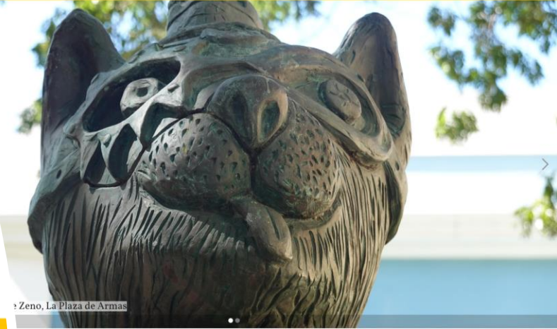
... Zeno, La Plaza de Armas

The Museo de San Juan continues to be an active part of the community by hosting events and tours which highlight Puerto Rican culture and history.