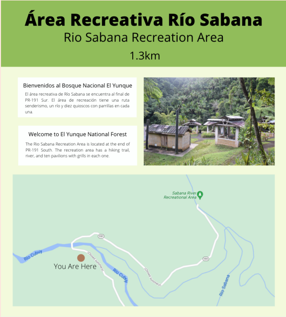
Figure 3: Example of Informative and Directional Road Sign for the Rio Sabana Recreational Area