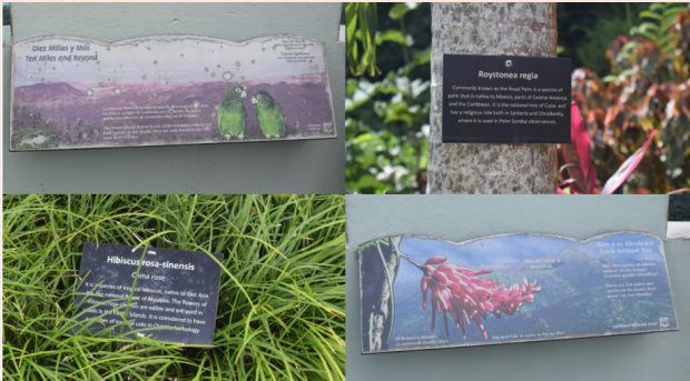
Figure 5: Examples of Informational Signs about Flora and Fauna

Note. These images were taken of signs in northern El Yunque (upper-left and lower-right) and the bed-and-breakfast Casa Flamboyant (upper-right and lower-left).