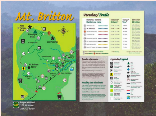
Figure 4: Map and Information for Mt. Britton Trails

Note. This is a map of Mt. Britton trails with information about the trails. A permanent map like this one can be added to the Rio Sabana Trails to help hikers understand the distance of the trail and where it leads to.