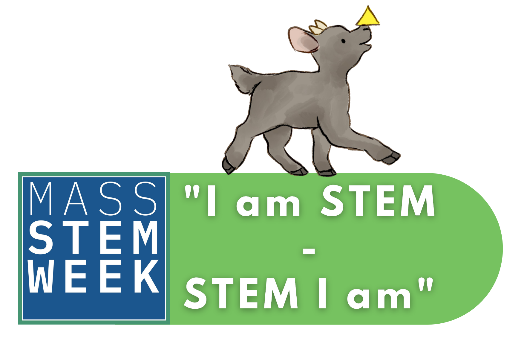
Illustration: Beck Arruda