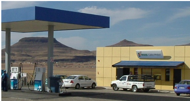
Figure 6: Caba Mdeni Integrated Energy Centre located in Magadla village in the Eastern Cape

Based on our investigation into community needs and concerns, we see the need for a centralized facility to provide the energy products and services required by the community. In order to teach the community about energy alternatives and make them more available, we recommend the implementation of a Monwabisi Park Alternative Energy Center. As a model for