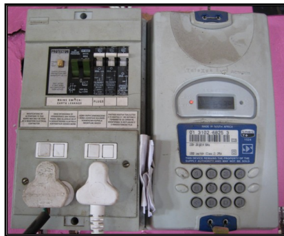
Figure 3: Eskom Electricity Dispenser

Formal connection to the electricity grid is obtained through an electricity dispenser, ED, which is directly connected to the nearest electricity supply pole. The box is delivered and installed by an Eskom (the local energy supplier) worker and costs R200. This is 13% of the average Monwabisi Park resident’s monthly income and is often a monetary burden on the family. Therefore people are also forced to purchase their electricity from a neighbor and informally connect to their ED. During windy and rainy times these informal connections