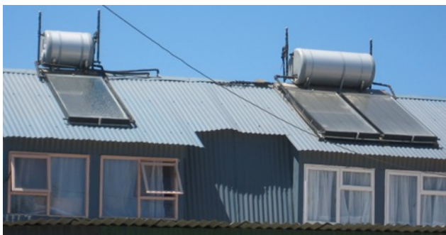
Figure 8: Solar Water Heaters mounted on the old Guest House at the Indlovu Community Center

We also believe that proper insulation is vital to future redevelopment and should be installed in every future community center building. These buildings must be checked for leaks prior to