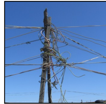
Figure 2: Example of informal connections in C2 section

Residents of informal settlements, like Monwabisi Park, have limited access to electricity. Electricity is commonly used throughout Monwabisi Park, however some areas are not provided access to the electrical grid. One of these areas is referred to as “C2” and the residents in this area do not have access to formal connections to the municipal electrical supply. The people in this area told us they were promised that after a road was built between them and their neighboring section, C1, the electrical company would install electrical poles so that they could have independent electricity. This never happened and the residents of C2 must rely on their neighbors in C1 to sell them electricity from their formal connection.