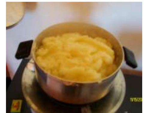
Figure 5: Pap cooked on the Arivi Stove