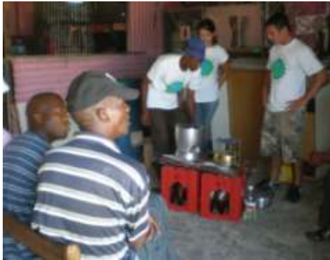
Figure 6: Presenting to the Community