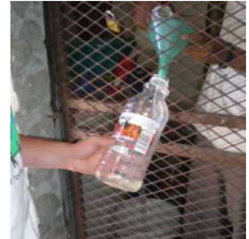
Figure 10: Buying a Liter of Paraffin at a cash store.

Another approach would be through the cash stores in the community. If twenty to thirty stoves were distributed to three or four different stores in the settlement, then the stoves would be more accessible to the community. The main problems associated with this