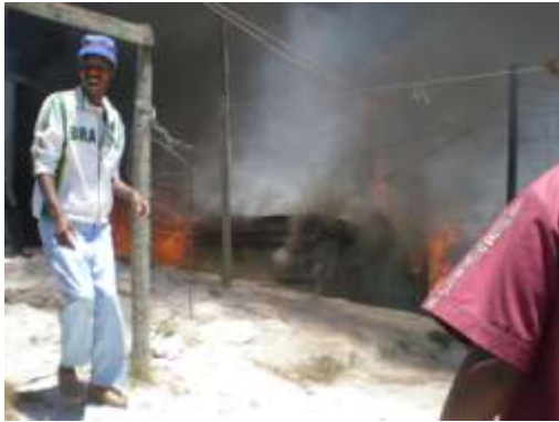
Figure 1: A fire that occurred while we were in Cape Town. It burnt down four homes.