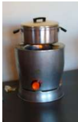
Figure 3: The Arivi Safe Paraffin Stove

Then we contacted various stove companies, specifically one called Arivi, which made safe flame stoves. Arivi sent us a prototype of one such stove to test and present to the residents of Monwabisi Park. We distributed the Arivi Safe Paraffin Stove to eight randomly-selected residents throughout the park for overnight testing. Along with the stove, we gave each participant a questionnaire regarding their experience with the stove to understand