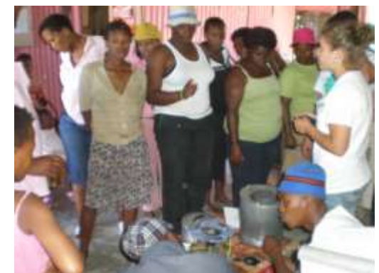
Figure 8: Answering questions about the stoves.

funding or finding a way to finance the safer methods is critical. Currently paraffin is the most convenient fuel for residents to buy be-