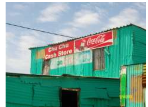
Figure 11: The only gas store in C section.

These are all options that would need to be looked into further before deciding on stove distribution.