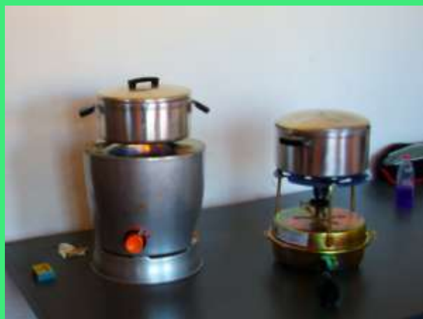
Figure 9: Arivi Safe Paraffin Stove (left), ParaSafe Primus (right)

There are two stoves we researched that best met our criteria that we would suggest: the Arivi Safe Paraffin Stove and ParaSafe Primus Stove. Both of these stoves decrease fire risks since they self extinguish when lifted or tilted. The emissions from these stoves are also safe and will not cause respiratory illnesses. After presenting these options to the community, we have received positive feedback and interest in both, and therefore believe that both can be successfully implemented within the settlement.