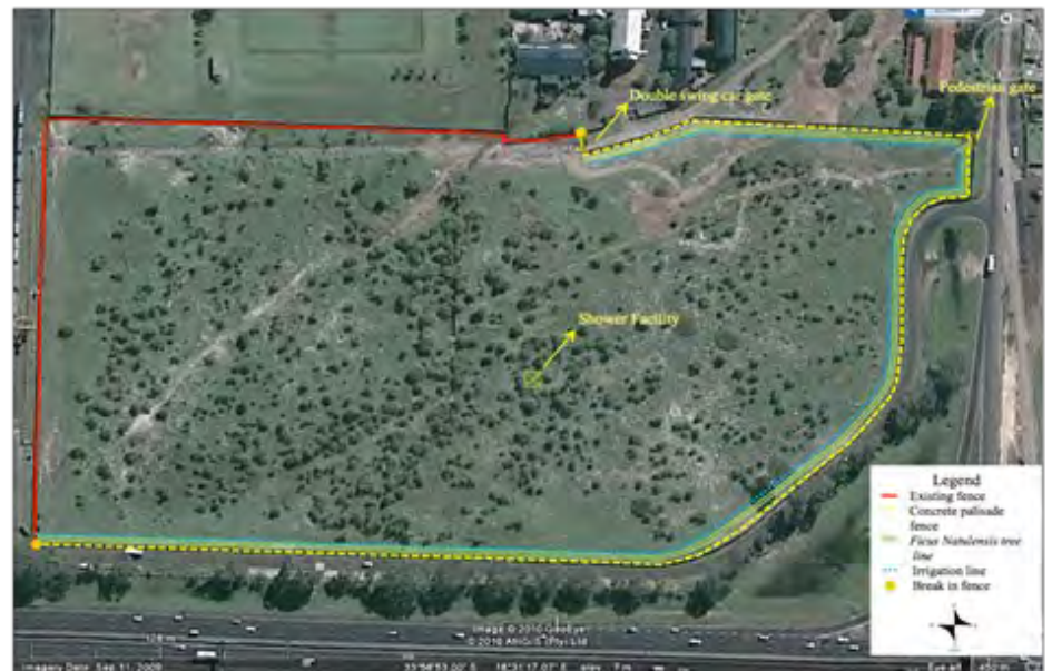
The Langa Initiation Site

While at the Langa Site, it was noted that structures such as showers are necessary and should be unobtrusive in appearance, that a site should take on a forest like appearance, and that organized site management that enforces rules and regulations, and community involvement has led to a safe site for the initiates at Langa. However, the most important feature at Langa is the concrete palisade fence. Over the years, this gated fence has helped preserve the ritual of initiation, while exposing challenges. Barring cases where gates have been left open, the site has been left untainted by trash dumping, cattle grazing, and the cutting down of trees for firewood. However, the fence has been vandalized in two lo-