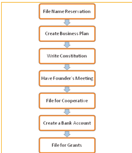
Figure 2: Projected progress path through the cooperative forming process

In order to help develop skills, encourage the beekeepers, and be utilized throughout our project, we decided that it was best to work closely with the beekeepers through the learning process. We do not know everything about business; however, we do have experience with research and utilizing all available resources. This knowledge we shared with the beekeepers to assist them through the process. See Figure 4 for an outline of the methodology.