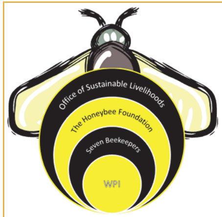
Figure 1: A unique diagram illustrating the cascading down of involvement in the Urban Beekeeping Project

The Urban Beekeeping Project was introduced by the City of Cape Town as an effort to produce a sustainable livelihood through beekeeping (see Figure 1). Thus seven individuals from the Cape Flats received