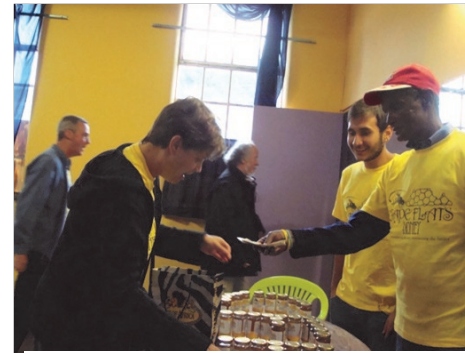
Figure 10: A picture of the beekeepers' first sale at the presentations of some of the other CTPC project groups

To our pleasant surprise, we finished our project having accomplished a great deal more than we had initially anticipated. We are