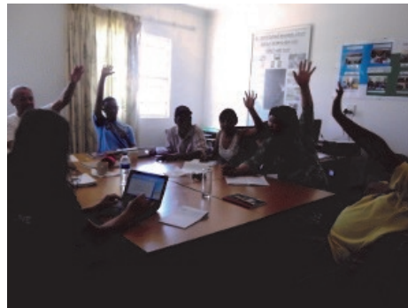
Figure 5: The beekeepers voting on officer positions for the cooperative