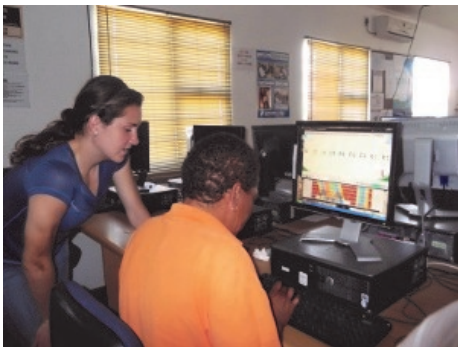
Figure 9: A picture of us helping the beekeepers to develop their typing skills

Additionally, the development of the beekeepers' abilities through practice and first-hand experience boosted their confidence and comfort level. One beekeeper explained that from the intense practicing of business writing: "I am a much better writer than I thought I was." Now that the group has confronted the wearisome tasks for cooperative establishment, they are better prepared to face future obstacles. Not only did the beekeepers grow from experiencing the thorough process, but our group learned alongside the beekeepers every step of the way. Working cohesively with the beekeepers, we shared the same questions and joined