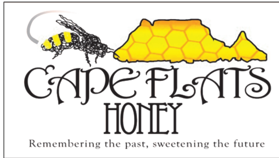
Figure 8: An image of the logo for Cape Flats Honey, the cooperative started by the seven beekeepers

This would shift the focus of the project from being one of weighing business options to one of pursuing one of those options. Thus, the role of our project group would be one of facilitation rather than consultation as we had originally anticipated.