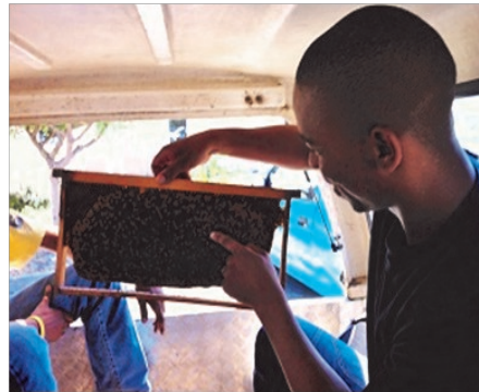
Fig 3: One of the beekeepers displaying the hive contents to our project group