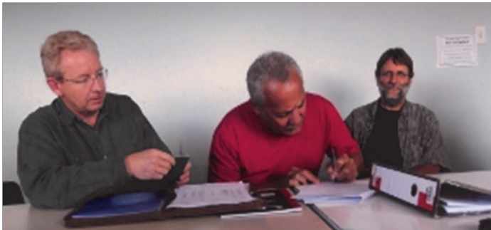
Figure 7: One of the beekeepers signing the lease agreement with The Business Place

Networking with the organizations linked to the project revealed a few things about the status of the Urban Beekeeping Project. For one, the seven beekeepers had decided to pursue the formation of a cooperative.