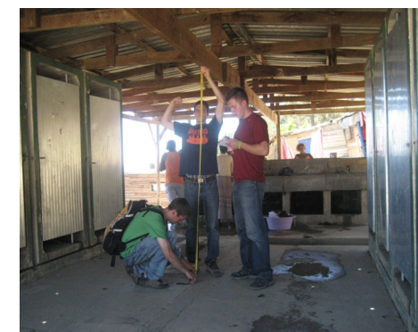
Figure 4: Assessing Sanitation Facilities

process of the objectives as well as the key outcomes.