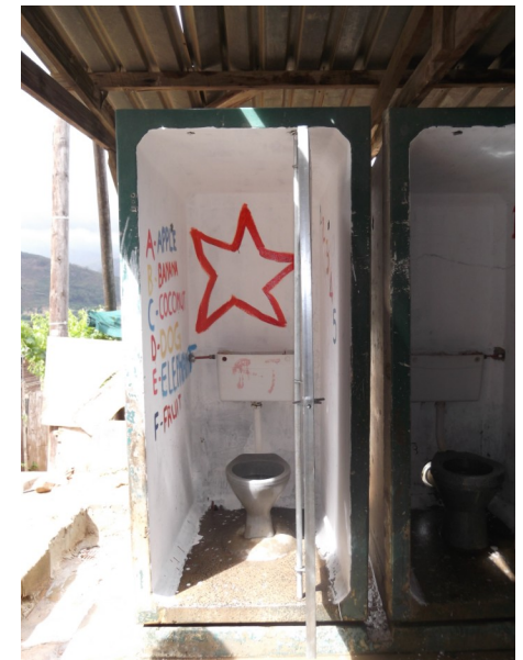
Figure 7: Completed Toilet Stall

To encourage early childhood development, our team and co-researchers painted the alphabet and numbers on wash basins as well as letters, words and shapes inside toilet stalls. Since mothers go to ablution blocks to complete many of their chores, they will be able to work with and expose their children to letters, numbers, shapes, and colours. This exposure is especially beneficial for families who cannot afford to send their children to crèches.