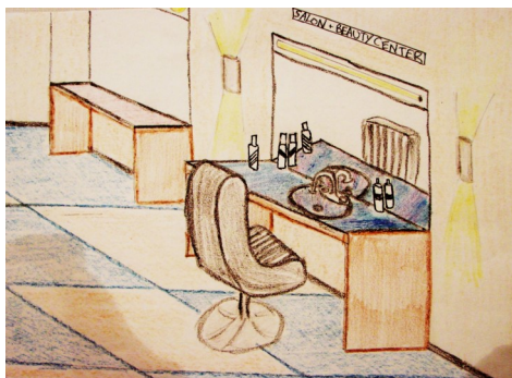
Figure 11: Salon Design for WaSHUp Facility

spaces that satisfy other community needs, in accordance with our second principle. The community expressed interest in laundry facilities, sinks, and showers, so all of