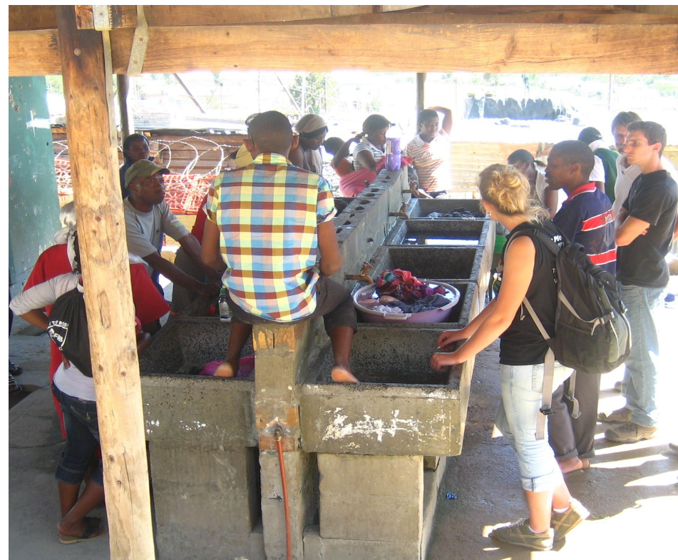
Figure 3: Informal Community Meeting at an Ablution Block

To accomplish these objectives, we applied action research. Unlike a traditional scientific inquiry where we would make a hypothesis, carry out an experiment, and analyse results individually , action research required that we complete these steps collectively , alongside our co-researchers and other community members (Ladkin, 2004). Sharing and listening to ideas identified key concepts that outlined the best way to address community WaSH problems. This method helped to break down the barriers that keep communities disempowered and researchers em-