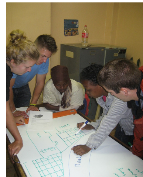
Figure 10: Co-researchers Designing WaSHUp Additions

residents were opposed to non-flush toi-