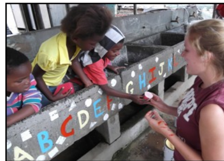
Figure 6: Painting the D-Section Wash Basins

After gaining an understanding of sanitation in Langrug, we collaborated with our co-researchers to determine how best to incrementally upgrade the existing WaSH facilities. Together we modified the 2011 WPI Greywater Team's informal settlement upgrading process to address WaSHUP ideas. This step by step approach, titled "The WaSHUP Process," guided our implementation work in D section, and will be used to direct future incremental upgrades to sanitation facilities. As seen in Figure 5 this process is cyclical, and is designed to be a model that can be repeated or modified by community members, governments, NGOs, and other interested organisations. The co-researchers will use this process on their own to upgrade existing facilities and evaluate their efforts, which helps promote our third principle.