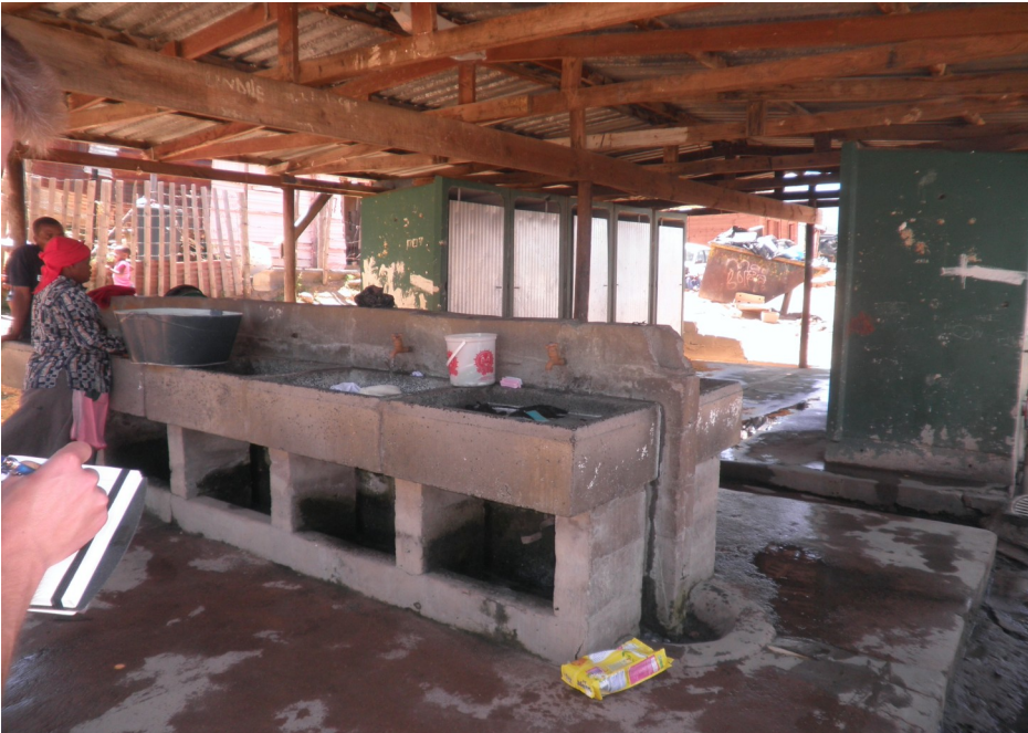
Figure 1: Ablution Block in Langrug

Government is currently the primary organization responsible for WaSH provision in South Africa. However, too often its top-down, subsidized, non-inclusive approach has not been successful. The facilities are typically unclean, smelly, and undignified. In addition, they regularly break. In Cape Town, for example, two thirds of the Cape Town Water Services Department's annual $125 million budget is spent on new equipment and repairs (Jiusto, 2010). A. Mels and colleagues (2008) report that providing conventional sewage solutions to Cape Town's informal settlements would far exceed the budget of the WSD. The magnitude of this challenge is too great for the government alone to solve. It does not have the required personnel, innovative capacity, or capital.