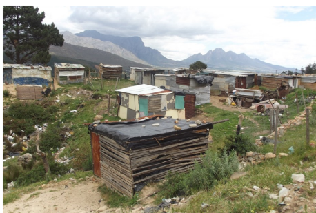
Figure 2: Langrug

WPI brings this partnership four years of experience working with WaSH issues in Monwabisi Park, an informal settlement located outside of Cape Town. In addition,