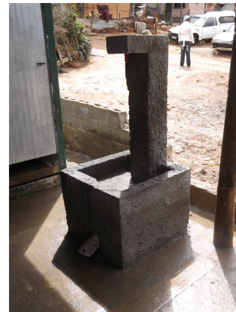
Figure 9: Foot Operated Tap

Adhering to our first and third principles, we involved community members, CORC, and other stakeholders before we drafted our designs. One method of involvement that was especially successful was our visit with Langrug residents and interested stakeholders to MobiSan, a successful urine-divergent, composting toilet system near Cape Town. Prior to the visit,