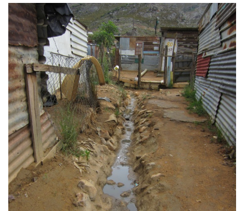
Figure 7: I-section channel with water flowing

A couple of days after building the greywater channel in J-section, the greywater team returned to find that the channel was already being clogged by trash and sand. The buildup posed a significant problem. It partially obstructed the flow of greywater, causing pooling in some areas. This almost immediate occurrence demonstrated the critical need to maintain and clean out greywater channels properly. Accordingly, the co-researchers held a meeting with J-section community members living near the channel in which they discussed the need for community maintenance of the channel. Through a series of meetings between the co-researchers and J-section community members, as well as meetings among