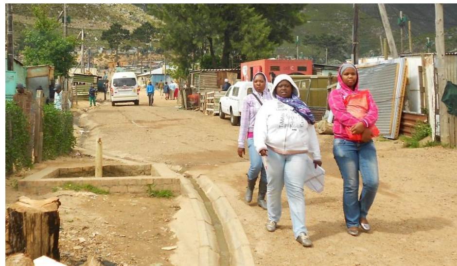
Figure 9: The co-researchers walking down the main road, to the project site in I-section

In the coming year, the co-researchers will continue to use and optimise the process to implement greywater management solutions throughout Langrug. WPI, CORC, and the Stellenbosch Municipality will support these efforts. The co-researchers have already initiated a large-scale project along a road on the eastern side of Langrug, and they have been able to get extensive community involvement in this project, even instituting a community member as project overseer. The co-researchers plan to act more as guides and advisors in the process, helping community members to understand their options and plan for implementation, but not being deeply involved in the physical labour. In order to aid in these efforts, the WPI students have left the co-researchers with a guidebook detailing the process and describing various greywater management options in detail, as well as a manual which can be used to explain the most pertinent options to community members. Using these resources, the co-researchers plan to experiment with new techniques, where applicable, in order to deter-