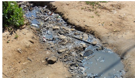
Figure 2: A greywater stream

much of Langrug, mostly unmonitored and uncontrolled, and often clogged with trash and silt. When a stream's path is blocked, the greywater pools, allowing bacteria to feed on food waste and multiply. This can lead to serious health risks, including infections and rashes. Some even attribute greywater to the spread of tuberculosis in Langrug. When heavy rains overwhelm Langrug's greywater drainage system, the problems escalate. During the winter, large quantities of rainwater cause the greywater streams to overflow into people's houses, posing a significant health risk.