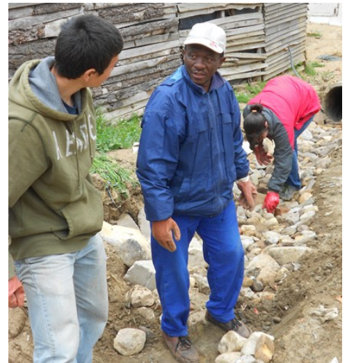
Figure 3: Working on the J-section channel

In order to set an example for the community and to learn more about the dynamics around community-based upgrading, the greywater team,