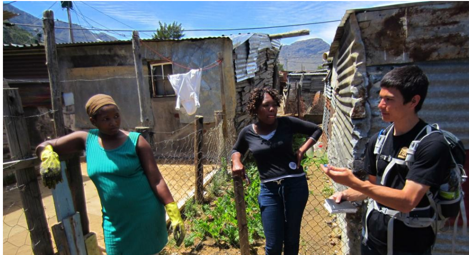
Figure 6: Meeting with the women who were cleaning the I-section channel

Although this process was applied specifically to greywater interventions, it can be generalized and adapted to apply to various community-based informal settlement upgrading initiatives. The team subsequently introduced this 8 step process to another team working in Langrug on the issues of water, sanitation, and hygiene, who adapted the process to upgrading ablution blocks and community spaces.