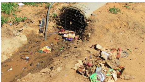
Figure 8: Trash cleaned out of sewage pipe in J-section as routine maintenance

the J-section community members themselves, a consensus on the need for regular cleaning was reached, and a system of regular cleaning was instituted.