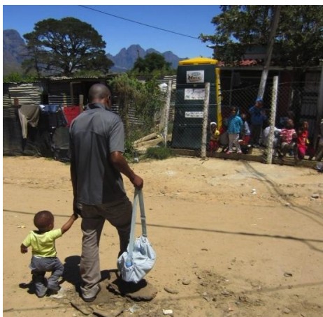
Figure 4: Father walking son to crèche across from J-section channel

composed of the four WPI students and four community co-researchers, implemented a greywater channel in Langrug's J-section. The location was chosen based on the existence of greywater problems and the proximity to a crèche. The greywater team attempted to encourage community involvement through informal discussion with community members, and was able to enlist the help of two community members living near the site. One of these community members helped daily with the work, and became an overseer for other greywater intervention projects after the first channel was finished. A stone-lined, cement-bonded channel was chosen for J-section based on suggestions from community members and discussion among the greywater team members. With support from WPI's Cape Town Project Centre, the greywater team obtained the necessary materials for the channel, which was constructed over the course of about a week. After completing the channel, the greywater team checked and doc-