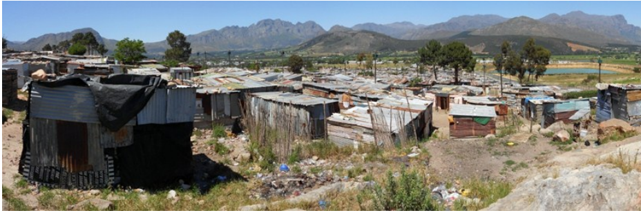
Figure 1: A panorama of Langrug from Nkanini