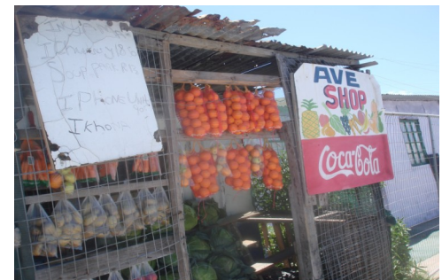
Figure 2: Ave Spaza shop in C section

The TTO is now hoping to expand its program into Monwabisi Park, one of the informal settlements in Khayelitsha. Monwabisi Park is situated on the outskirts of the city of Cape Town, and an estimated 20,000 people live there in an assortment of shacks, with many spaza shops located in the settlement (WPI Cape Town Project Centre, 2008). While some general research into the spaza market of South Africa has been performed, very little work with spazas has occurred in Monwabisi Park.