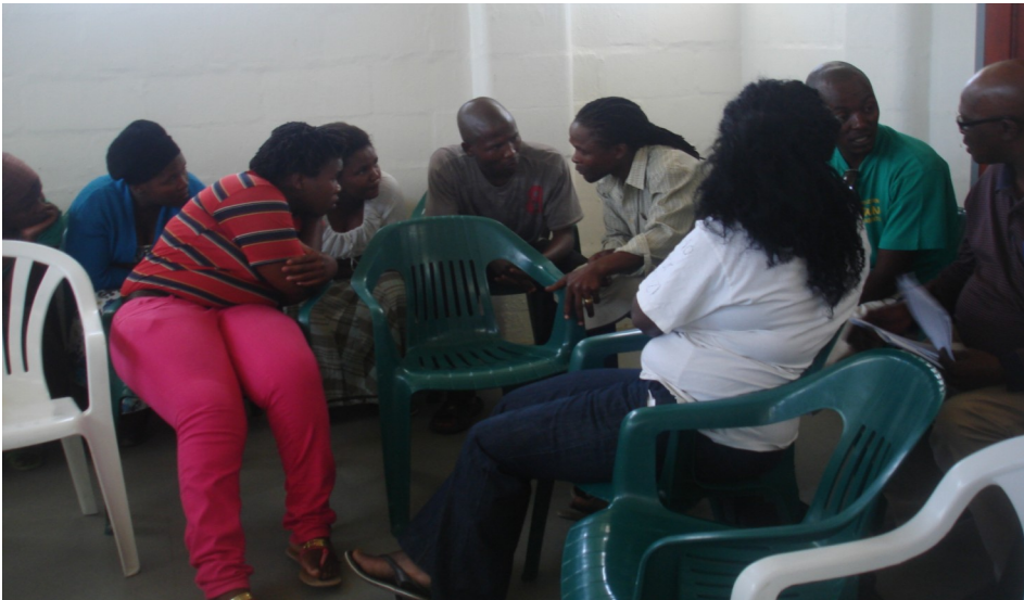
Figure 10: Spaza shop owners discussing setting up a spaza association

In terms of communicating with shop owners, it was pivotal for our team to utilize co-researchers, personable members within the community who are familiar with the area and various people throughout the settlement. Our team recommends attempting to work with local community members when conducting cross-cultural research. Our co-researchers helped us build trust with spaza shop owners, and through their experience and wisdom taught us about the current economic and political environment.