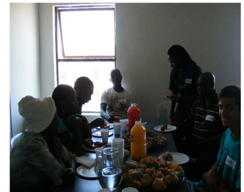
Figure 5: Shop owners eating at the close of the Focus Group Discussion

We developed a detailed discussion plan to facilitate the meeting with, and invited twelve spaza shop owners to the meeting, which we held in the Indlovu Centre in C-section of Monwabisi Park. Getting people to attend such a meeting can be difficult due to the demands of living in an informal settlement and because owners have to take time away from their shops. To ensure attendance, we went to their shops, gave them a flyer and asked for their name and phone numbers to call them the morning of the meeting to remind them to come.