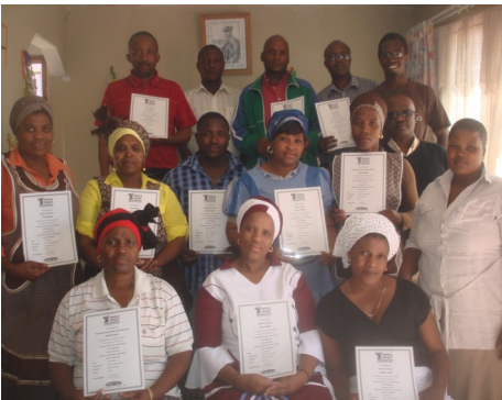
Figure 6: Harare shop owners at their graduation from business training