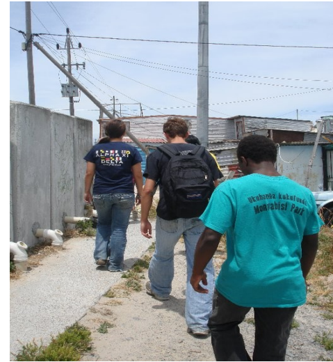
Figure 4: Mapping spaza shops in Monwabisi Park with co-researchers.

During the mapping phase we held informal conversations with some shop owners when the opportunity arose, but we conducted in-depth