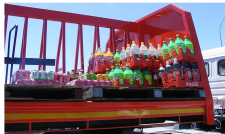
Figure 9: Coca-cola truck delivering goods along Mew Way.

3. There are no current channels of communication among spaza shop owners.