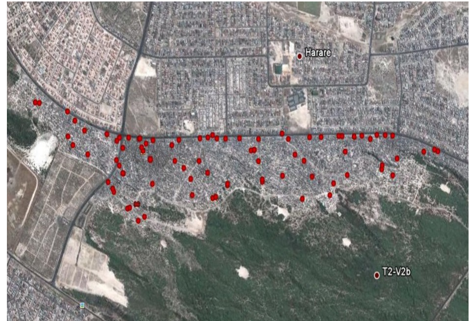
Figure 7: Map of the spaza shops in Monwabisi Park

The team was able to develop a map of all the spaza shops in Monwabisi Park. We identified one hundred spaza shops in Monwabisi Park. Breaking the shops down in to sections, there are 16 shops in A section, 32 in B, 40 in C, and 12 in M section. We attribute this primarily to the relative sizes and populations of each section; B and C sections are larger