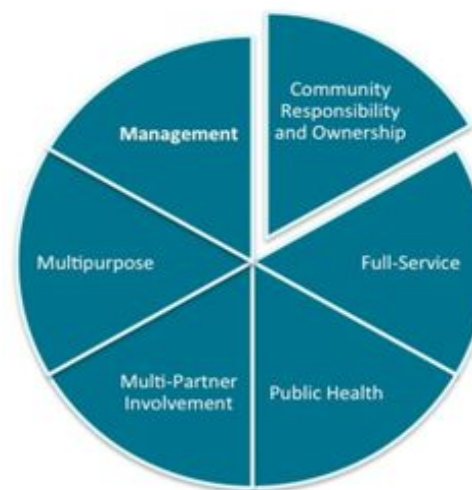
Key WaSH-UP Principles

Community-Driven Operation: The community is responsible for the operations and maintenance of the facility. The people hired as caretakers come from the community but the entire community is responsible