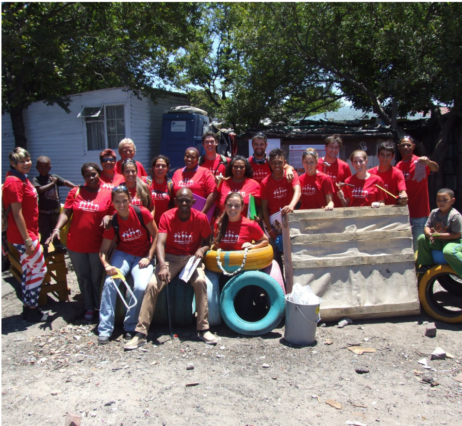
An Interactive Qualifying Project submitted to the faculty of Worcester Polytechnic Institute in partial fulfillment of the requirements for the Degree of Bachelor of Science.